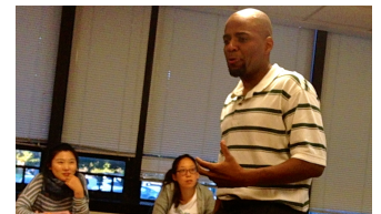
ACADEMIC WORKSHOPS DATA COLLECTION: OCTOBER 1, 2014: