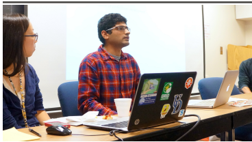
UPCOMING CAREER EVENTS CAREER WORKSHOPS FOR CEEP STUDENTS