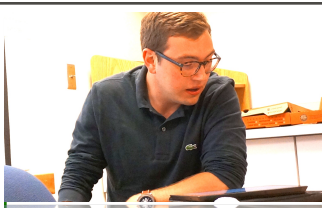
UPCOMING SOCIAL EVENT HALLOWEEN PARTY ON OCT. 24 STARTING @7PM