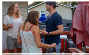
RECENT SOCIAL EVENT WELCOME BACK BBQ EVENT AT ED'S PLACE