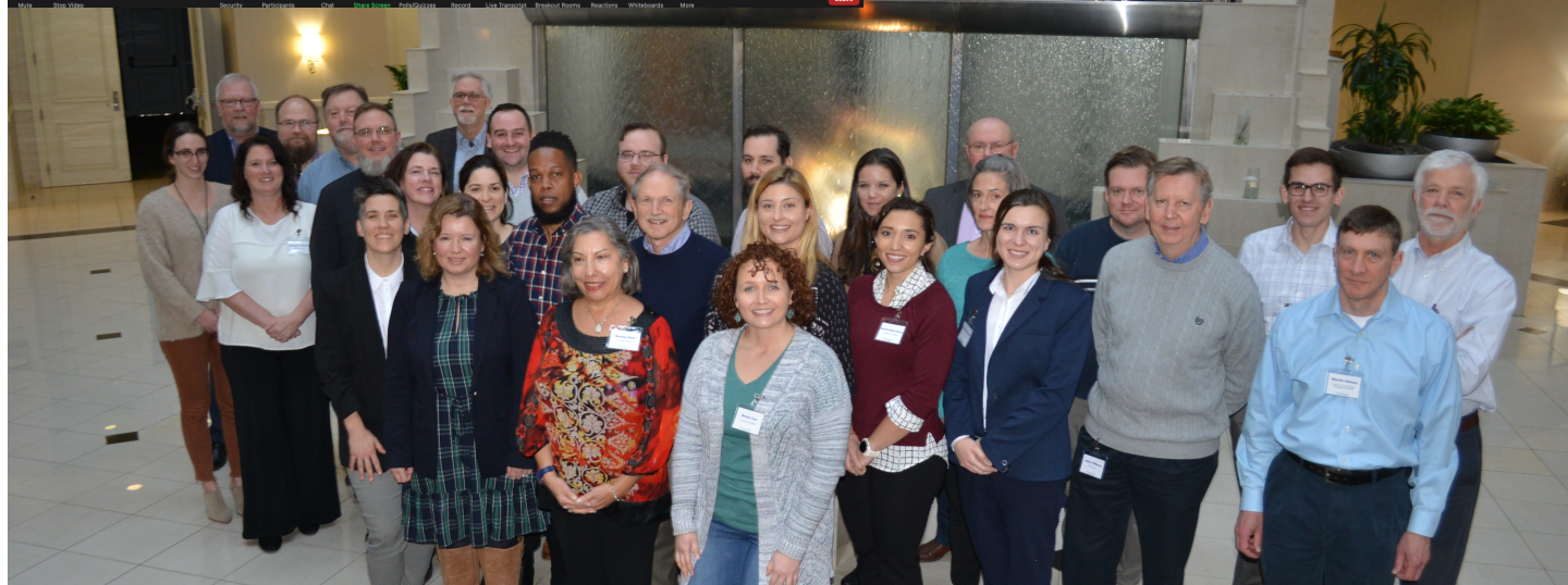
Course participants and instructors from January 2020

Example previous participants' (including those not shown) affiliations: Avangrid Renewables; Bermuda Electric Light Co. (BELCO); Bureau of Ocean Energy Management (BOEM); Delaware Department of Natural Resources and Environmental Control; Division of Climate, Coastal, and Energy; DC Department of Energy and Environment; EDF-Renewables; EDP Renewables; Liberty Power; MARACOOS; Mayflower Wind; National Renewable Energy Laboratory; New York Offshore Wind Alliance; NYSEDERA; New York State Energy Research and Development Authority; NY Workforce Development Institute; Pacific Ocean Energy Trust; POWER Engineers; Ørsted North America; Shell; Special Initiative on Offshore Wind; Stakeholder Forum for a Sustainable Future (NY Rep. to the United Nations); ThayerMahan; United States Coast Guard; US Navy; US Department of Energy; Vineyard Offshore; Wind Quarry LLC.