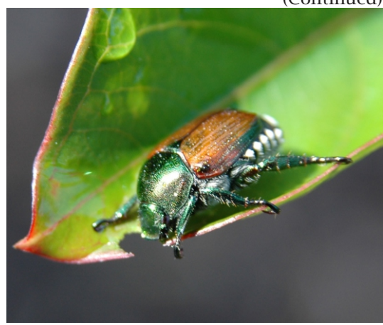
Japanese beetle adult.