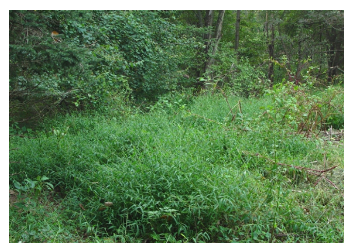
Japanese stilt grass flowering in August.