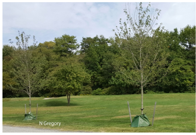
Establishment of trees.

flowering but prior to seed set to effectively reduce seed development for the next year. She also found a three inch layer of leaf mulch reduced germination of stiltgrass in test plots in White Clay Creek, but a one inch layer was not sufficient.