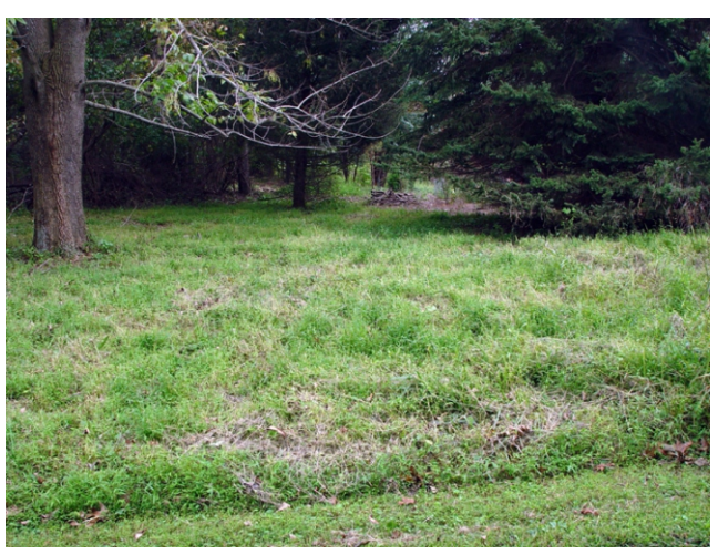
Japanese stilt grass mowed closely to prevent seed development.