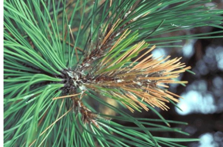
Sphaeropsis tip blight.

SPHAEROPSIS TIP BLIGHT (also known as Diplodia tip blight) affects Austrian pines ( Pinus nigra ), Scotch pine ( P. sylvestris ), ponderosa pine ( P. ponderosa ), Japanese black pine ( P. thunbergii ) and mugo pine ( P. mugo ). The disease occurs most often in well-established plantings, and trees over 20 years old. Trees with chronic drought stress, winter injury or mechanical injury may be predisposed. Fungal fruiting bodies can be seen on branch tips and on cones. Little can be done for control, except sanitation or pruning of dead branches and reducing stress on trees. Fungicides such as myclobutanil may be warranted for use on specimen trees.