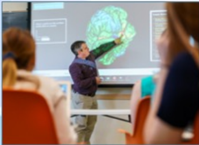
Brain Science class, ISE Lab