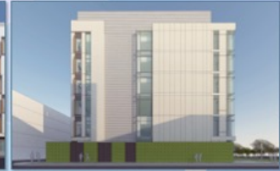
View from North

We have the opportunity to create and grow a vibrant new industry for Delaware's future. The rapid advancement of biopharmaceuticals is changing the face of health care in the United States. Biopharmaceuticals involve the development of personalized medicines with the potential to treat or even cure some of the most devastating diseases, including cancer and diabetes, as well as reduce hospital care and thereby reduce health-care costs.