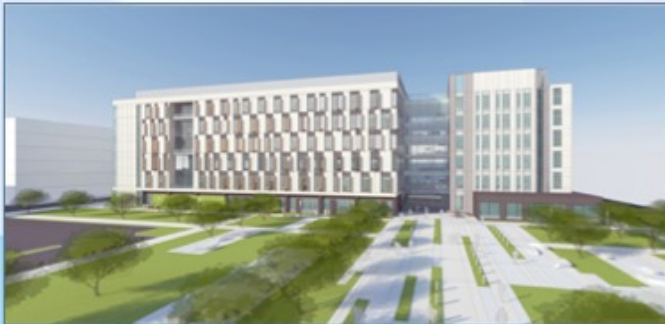
Biopharmaceutical Innovation Building — $60M