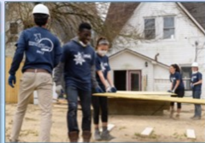
Habitat for Humanity, Laurel

We are grateful for the state's investments in UD in previous years, which have helped fuel UD's economic engine for the state of Delaware. By investing in successful partnerships, you're helping to build a strong and stable workforce for our state. Some 50,000 UD alumni live in Delaware — raising families, working in the public, private and nonprofit sectors, and contributing to the vibrant society we all enjoy.