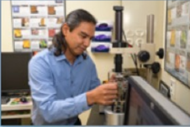
Biolmaging Center at DBI — Developed through state partnership since 2001