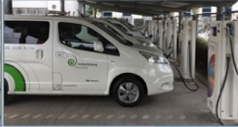
Vehicle-to-Grid Technology — Pioneered at UD