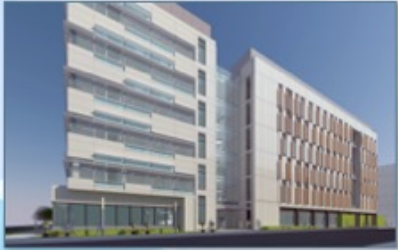
View from Southeast