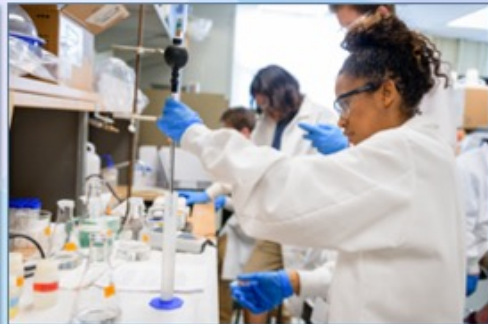
Deferred Maintenance — $6.5M

We are requesting the State to partner with us in this one-of-a-kind opportunity and invest $60 million in capital funding to support construction of this transformational facility, either from the FY19 one-time surplus or through a phased-in approach over the next three years.