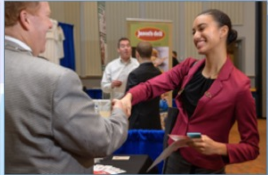
On-Campus Career Fairs

Our graduates want jobs with good pay and benefits, of course. But they also want jobs that encourage them to be creative and innovative — jobs in fields that are growing and with organizations that are discovering new ways of doing things. They want to know that their work is meaningful and, ultimately, contributes to building a better, healthier and more sustainable world.