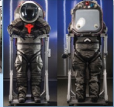
ILC Dover's Z-2 Suit — Components developed by UD's Center for Composite Materials

The University of Delaware is a top-tier research university, so our role is to not only educate students and prepare them for careers, but also to make the discoveries and develop the innovations that will create whole new industries that provide jobs that may not even exist today. We attract industry, and we develop the workforce for those industries.