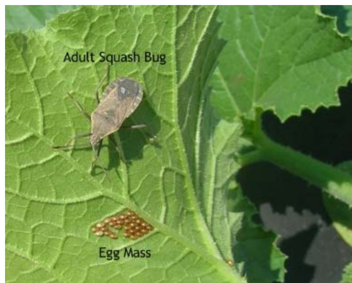
Figure 1. Squash bug adult and egg mass

Many of the pumpkin fields in the Delmarva area I have visited in the last two weeks were just coming up or had 2-5 leaves on them. I was surprised to see several squash bugs on these small plants. I also found many egg masses (Fig. 1) on the underside of leaves, usually in the crotch of two veins. In some fields with plastic the squash bugs were feeding below the plastic mulch causing the plants to wilt (Figs. 2 and 3) and eventually die. Normally there are only a few fields that will have squash bugs this early, but just about all of the fields I looked at had enough squash bugs to justify treatment. Growers need to watch for squash bugs on their early pumpkin plants, especially down in the plastic hole. A spray may be needed if the plants are stressed (like they were last week from the intense heat) and there are 2 bugs or 1 egg mass per plant.