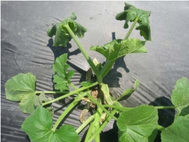
Figure 2. One pumpkin plant (top) wilting due to squash bug feeding

moderate to low infestation levels of squash bugs, these parasitoids will not keep a large population of squash bugs below thresholds.