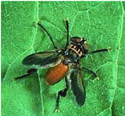
Fig. 4 Trichopoda pennipes adult