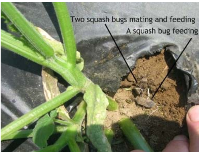
Figure 3. Squash bugs at the base of wilted pumpkin plant under plastic mulch