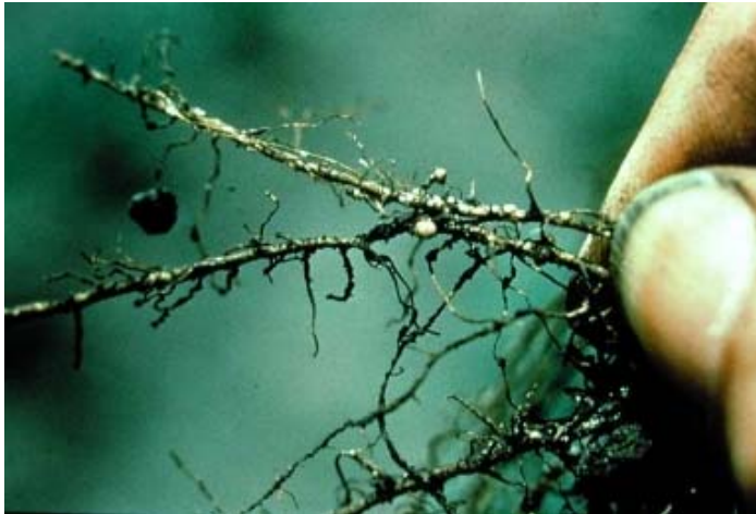
Small white female SCN and a large nitrogen fixing nodule for comparison. (SON)

being planted after barley and wheat it still is not too late to soil test for SCN, especially if you are not planting a resistant variety.