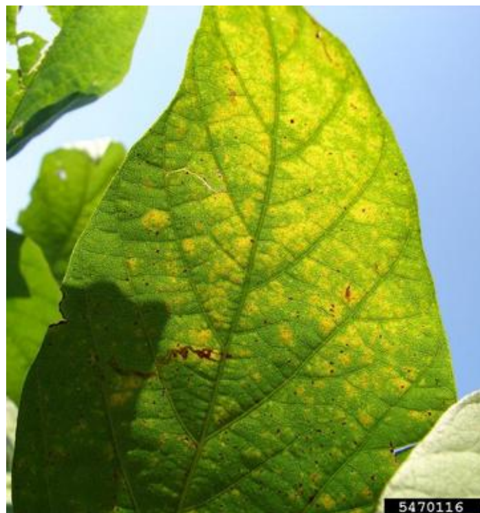
Figure 2. Early symptoms of soybean rust may be easier to visualize if the leaf is backlit by sunlight.

English.pdf . Hard copies of this document are also available at the UD Plant Diagnostic lab and our Kent and Sussex county locations.