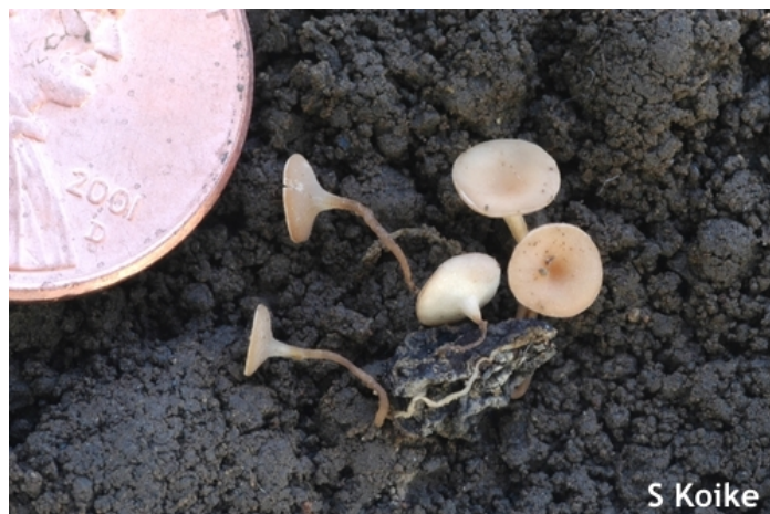
Figure 1. A sclerotium with five apothecia. Each apothecia will eject many infective spores into the crop canopy. Note the small size of the apothecia.

and humidity levels are high, often after canopy closure.