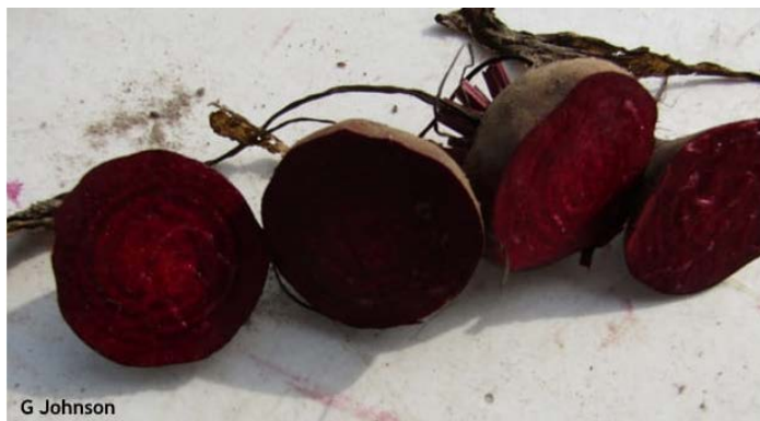
G Johnson Some beets can withstand temperatures as low as 12°F

Floating row covers offer the best protection of sensitive vegetables against frost and freeze injury, depending on the thickness of the row cover, expect 2-6°F degrees of protection. Moist soil also can store some heat, lessening frost, and sprinklers can be used for fall frost protection (see past articles on spring frost protection).