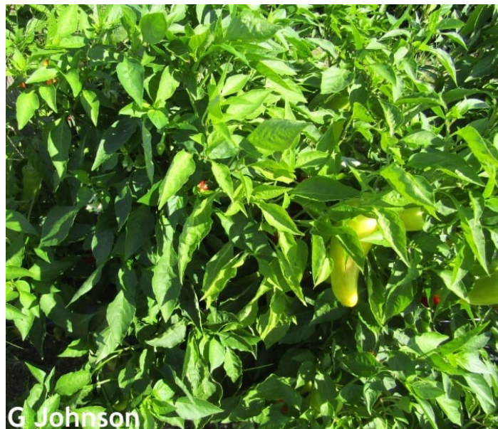
Peppers will tolerate frosts in the fall, tomatoes will not