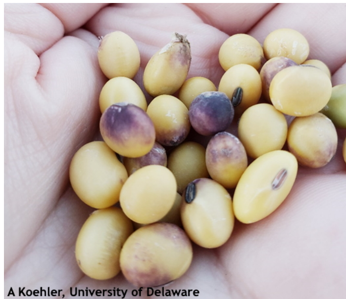
A Koehler, University of Delaware Figure 1: Purple seed stain

pathogen Colletotrichum . Symptoms can be present on the stems, leaves, or pods. Pods that become infected often have reduced or no seed formation and the pod may be filled with fungal mycelium. Seed that does from is usually shriveled, moldy, and discolored.