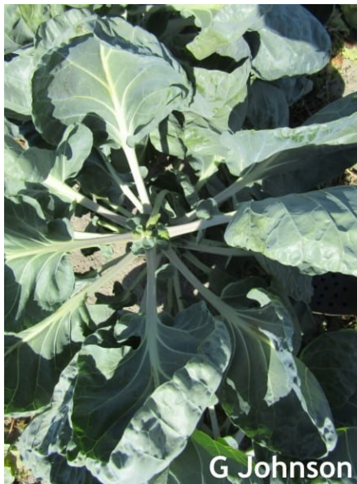
Brussels sprouts are frost and freeze tolerant to 20°F.