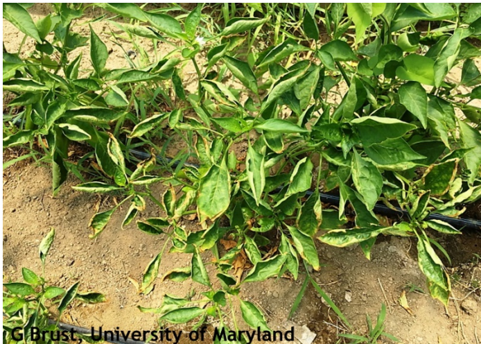
Figure 1. Soluble salt damage to peppers in a high tunnel

However, another scenario that I think is happening more often in our high tunnels is when plant roots absorb the excess salts in the soil and are unable to metabolize them. The soluble salts enter the roots and are moved through the water conducting tubes to the leaves where the water evapotranspires, gradually concentrating the salts to toxic levels. The consequence of this type of salt stress in plants is a myriad of problems such as: poor growth, thin canopy, excessive leaf drop, poor fruit set and poor yields, with the next damage level up being necrotic leaf margins, especially on older leaves that can curl (Fig. 1).