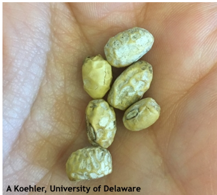
A Koehler, University of Delaware Figure 2: Seed with a cracked, shriveled appearance and covered with chalky to white mold may have Phomopsis seed decay