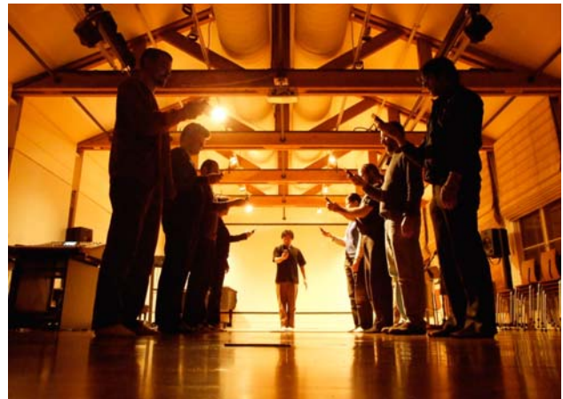
Figure 1. The Mobile Phone Orchestra of CCRMA playing the piece DroneIn/DroneOut by Ge Wang (2008)

Mobile Music Workshop '08 , May 13–15, 2008, Vienna, Austria.