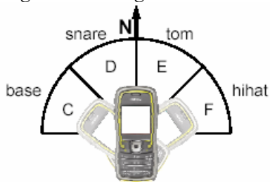
Figure 2. The accelerometer/magnetometer based interaction of ShaMus.

The hand is a major site of human motor control and most musical instruments rely at least in parts on hand and arm actions. There are a number of technologies that allow sensing of gestures, usually using accelerometers. These platforms include the Mobile Terminal [17], Mesh [11] and XSens [13, see for a review] for iPaqs. The Shake [10] which is platform independent and connects via Bluetooth.