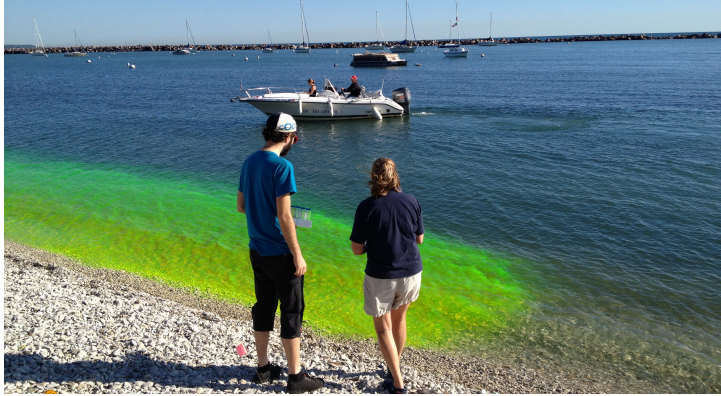
Pictured Above: Fluorescein dye released at the shoreline quickly dispersed along the shore with little mixing with off shore waters.

Water circulation is also an issue within the marina. Pollution that is washed into the water is not easily removed at South Shore beach. The beach is enclosed by a breakwall with minimal water circulation. Around the Great Lakes, beaches in highly developed areas and within breakwall structures are notoriously have poor water quality. Dye studies by the McLellan lab have revealed there is a dominant along shore current, with little exchange with the deeper water off the beach. The rocky beach, just 150 meters to the south of the existing beach, is opposite an opening in the breakwall and closer to the end of the breakwall, which improves circulation. Prevailing currents during two summers of study were from the south to the north, which brings lake water with less pollution to the rocky beach. The exact current patterns vary day to day, however field observations and studies of water movement suggest water exchange is greater at the rocky beach compared with the existing beach.