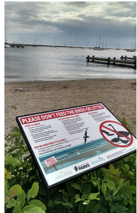
Pictured above: South Shore just south of the beach where geese, gulls and ducks congregate.

Human waste has also been intermittently detected at low levels. Illicit discharges from boaters and/or leaking sewer lines are two possible explanations and are being investigated. In addition, there are more large-scale, regional sources of fecal pollution during heavy rain that impact not only South Shore, but also many of Milwaukee's beaches. Combined sewer overflows (CSOs) occur when there is extreme rainfall 1-2 times per year and beaches close to the harbor or CSO outfalls are contaminated affected. Human waste presents a serious health hazard as it carries disease-causing organisms.