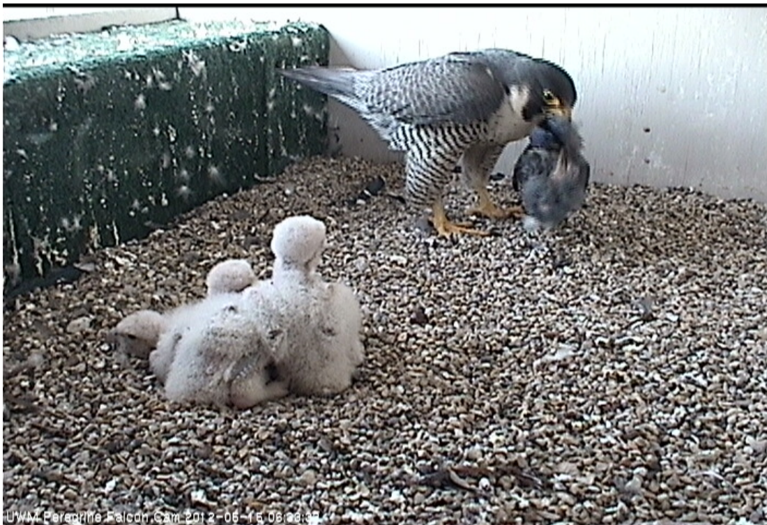
UWM Peregrine Falcon Cam 2012-05-15 08:08:09 5-15-2012 - Breakfast is on its way.