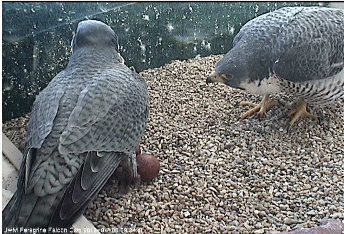
4-8-2012 Male on left, female right. The male was just sitting on the eggs.