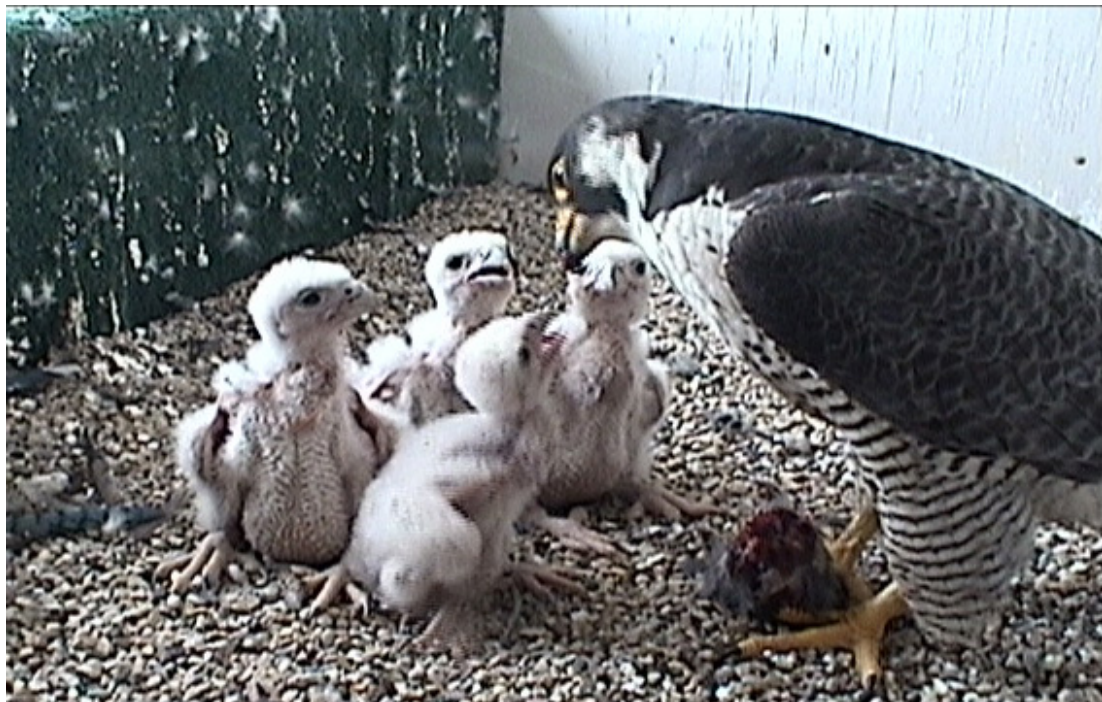
5-16-2012 - Not their most photogenic period....