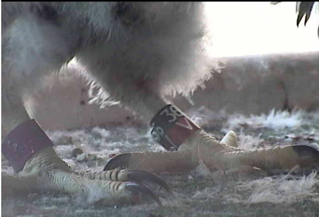
5-29-2012 - Chicks received there leg bands today.