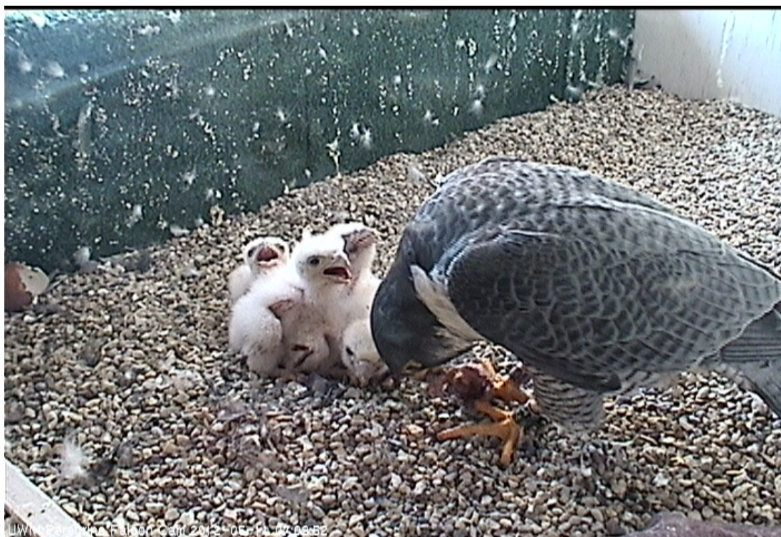
5-11-2012 - Male feeding the 4 chicks.