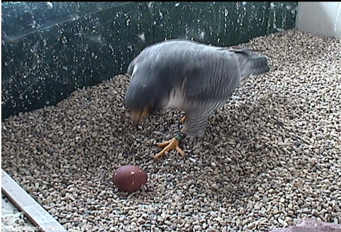
3-30-2012 - Male in to inspect the egg.