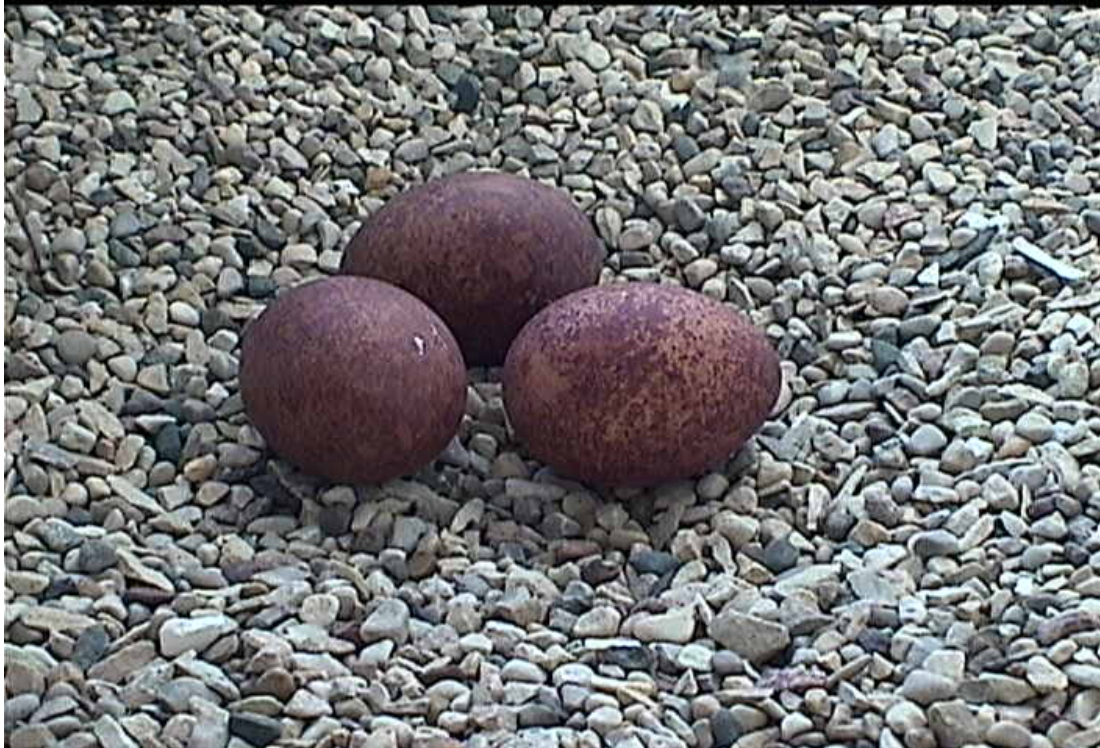
4-1-2012 - 3rd egg arrived about 8:20PM last night.