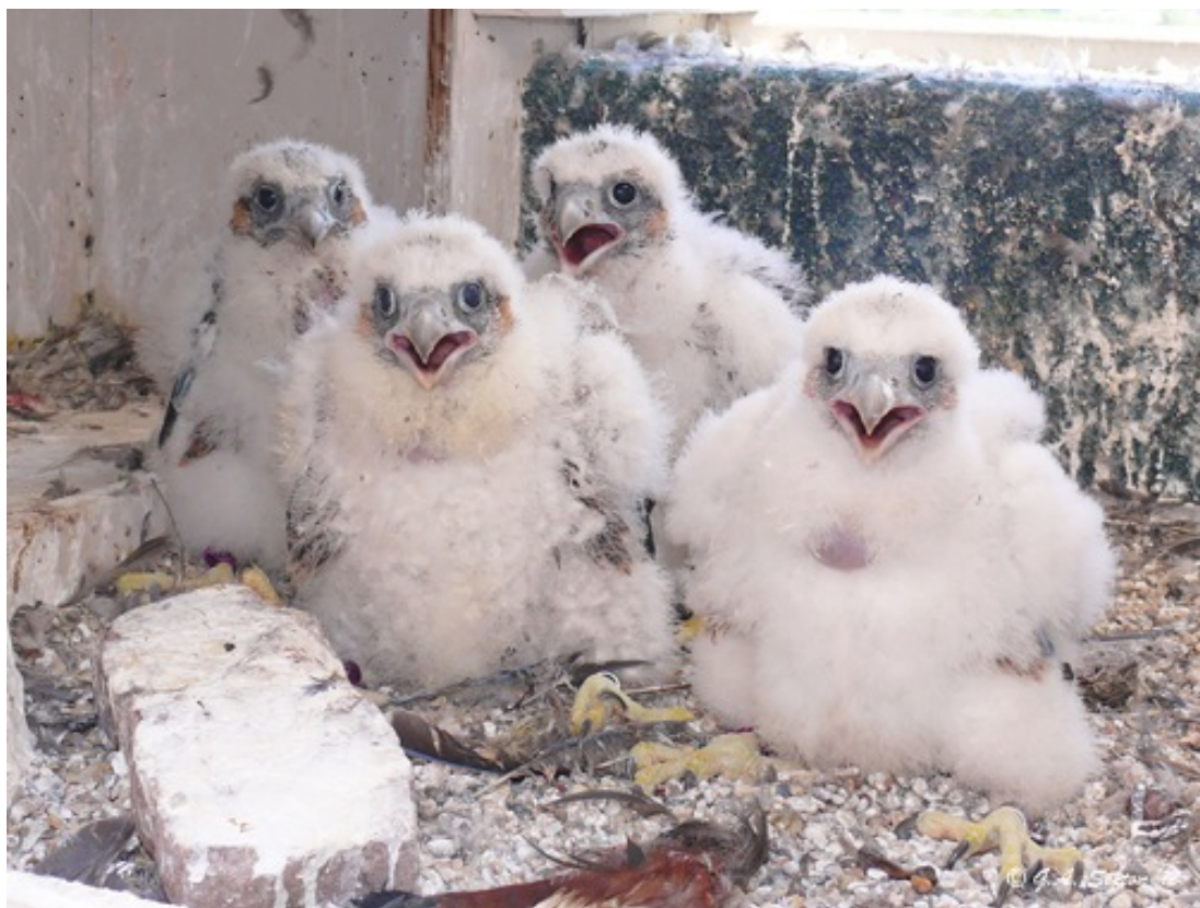
5-29-2012 - Back in the nest box after being banded.