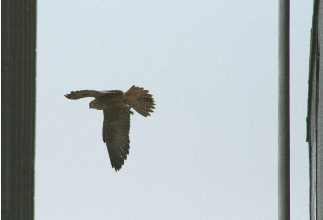
6-27-2012 - One of the young flying between Lapham and the EMS Building.