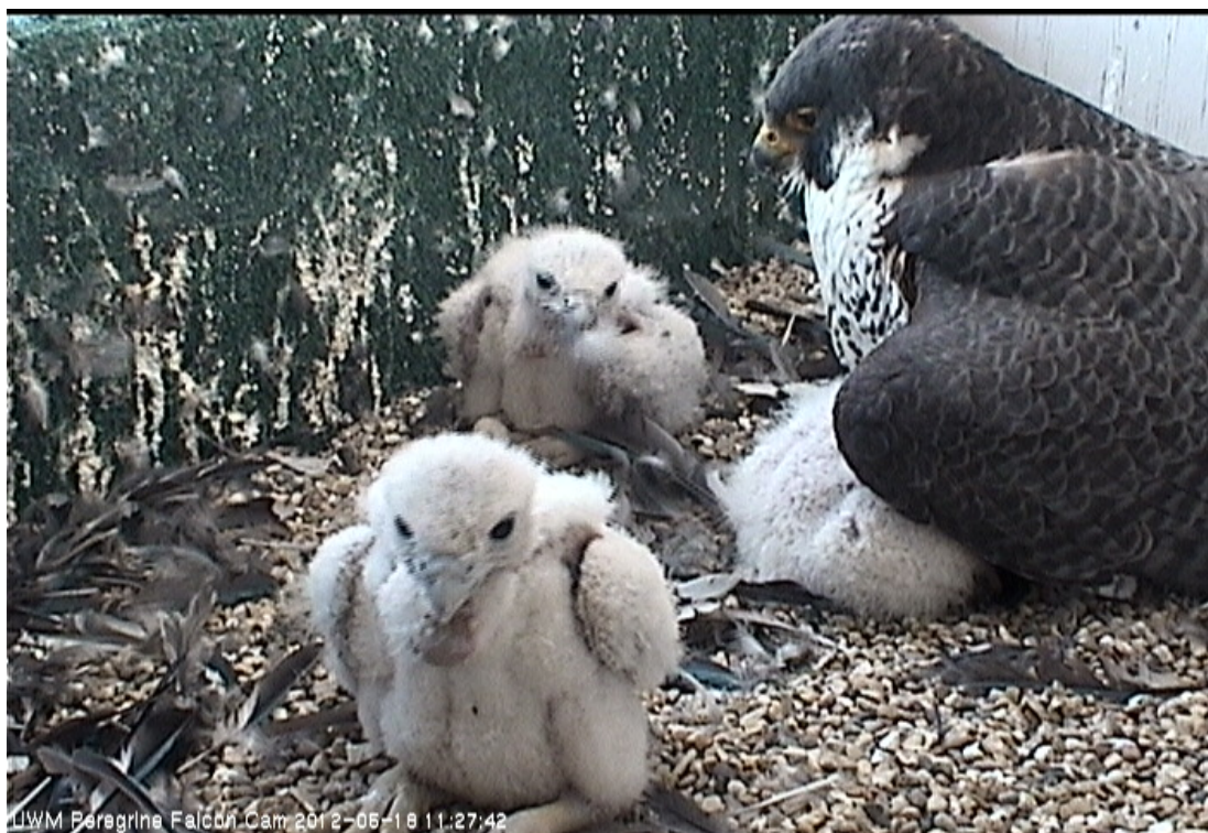
5-18-2012 - Starting to explore the nestbox.