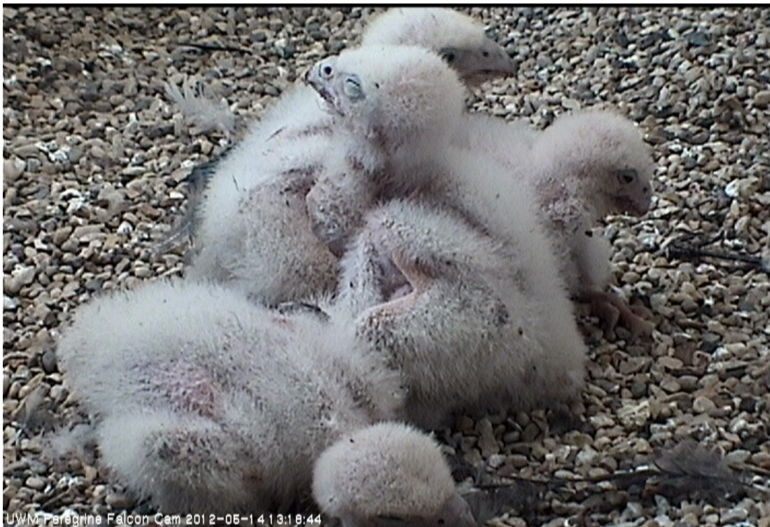
5-14-2012 - Chicks are getting big.