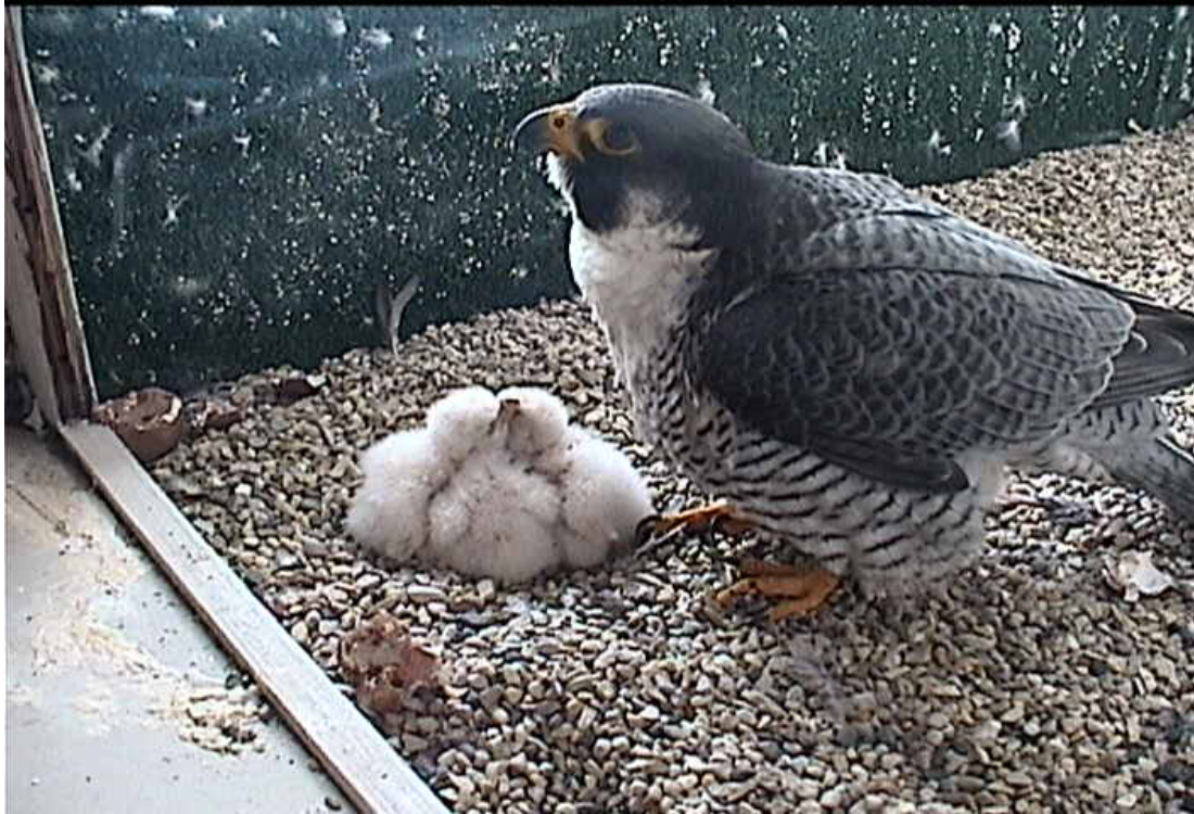
5-7-2012 - Male with 3 chicks.