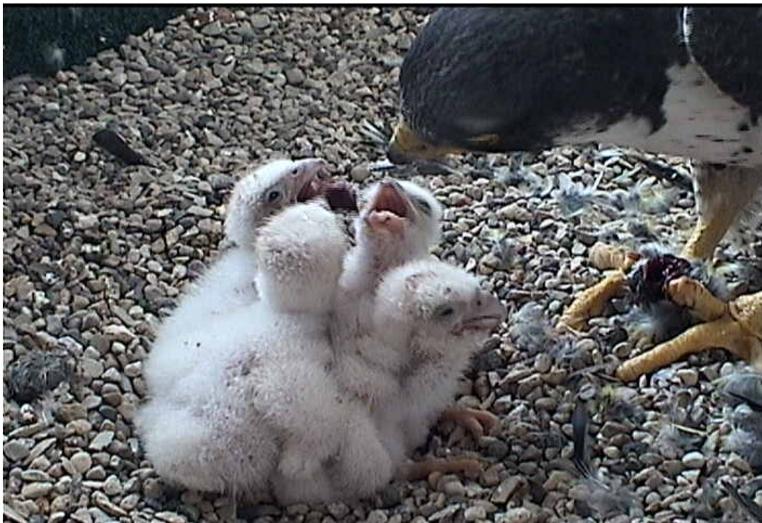
5-9-2012 - 4 chicks being feed by mom.