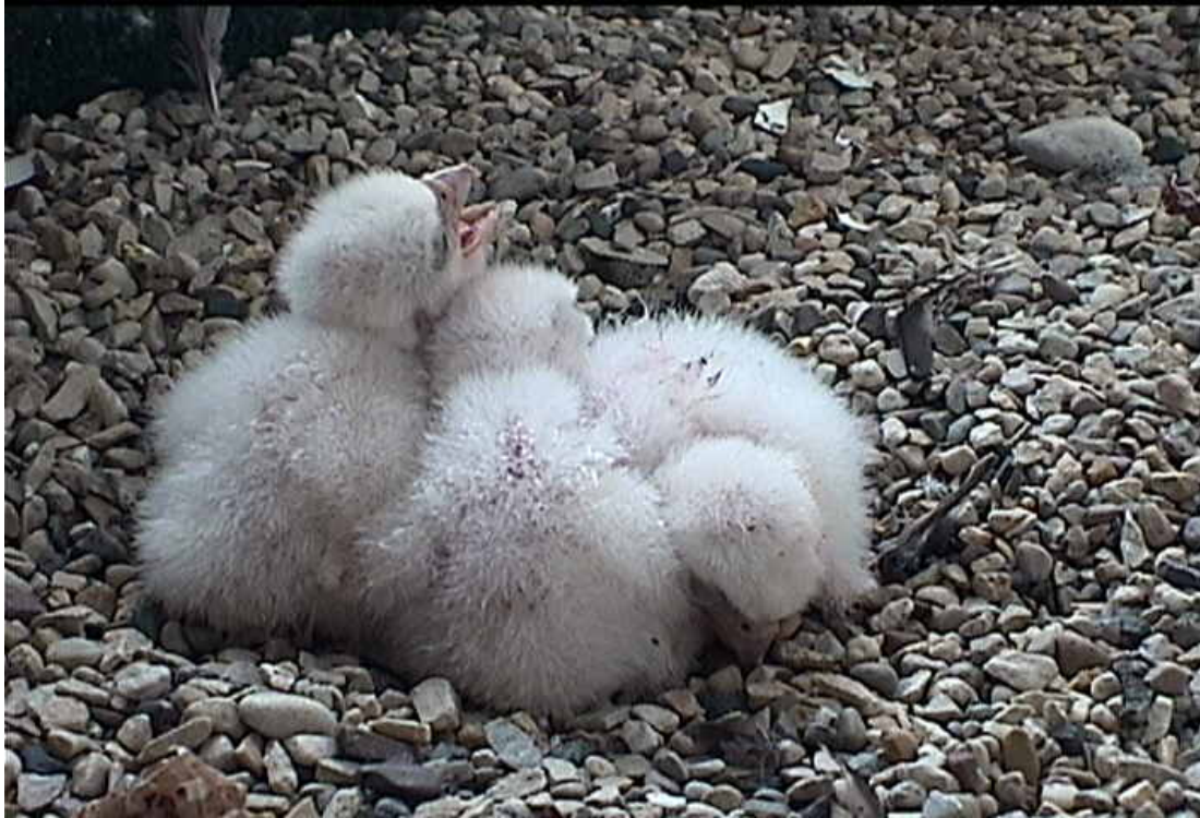
5-7-2012 - 3 chick have hatched.