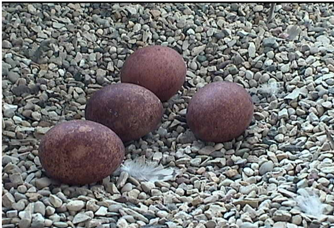
4-5-2012 - 4th egg arrived today about 5:30am.