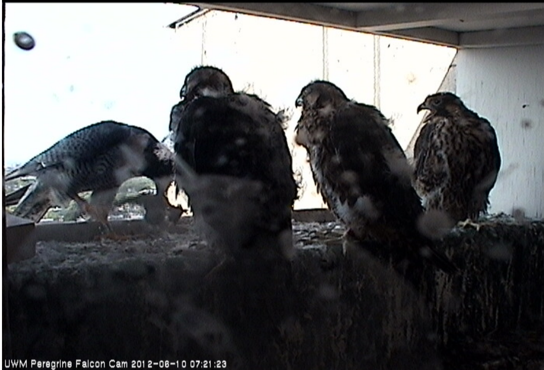
6-10-2012 - Male with a bit of food for the chicks.