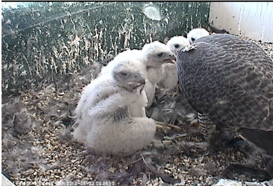
5-22-2012 - All in a row.