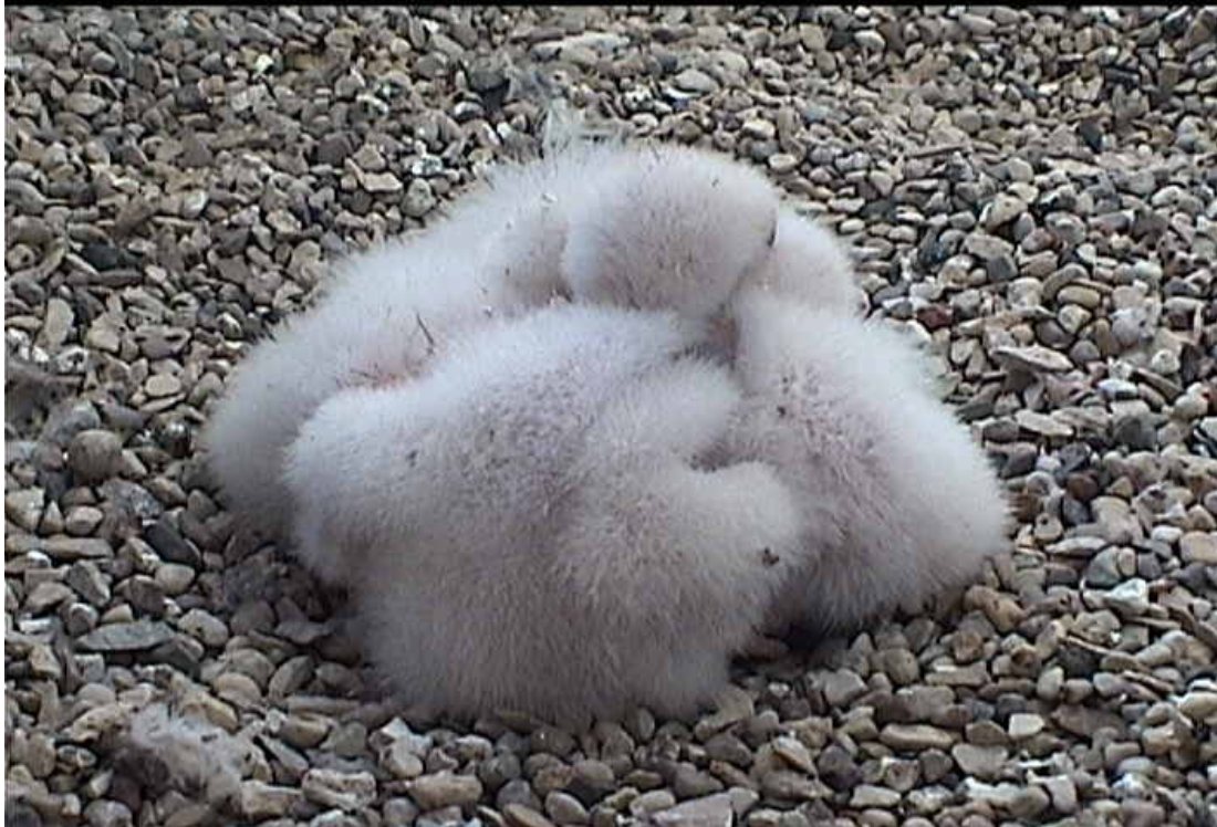
5-10-2012 - Ball of 4 chicks