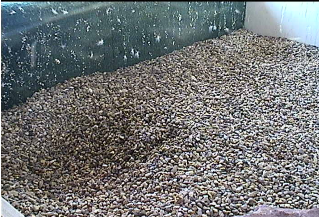
3-12-2012 - A new scrape has been dug. All of the gravel was replaced at the end of last season so it is clean and very soft.