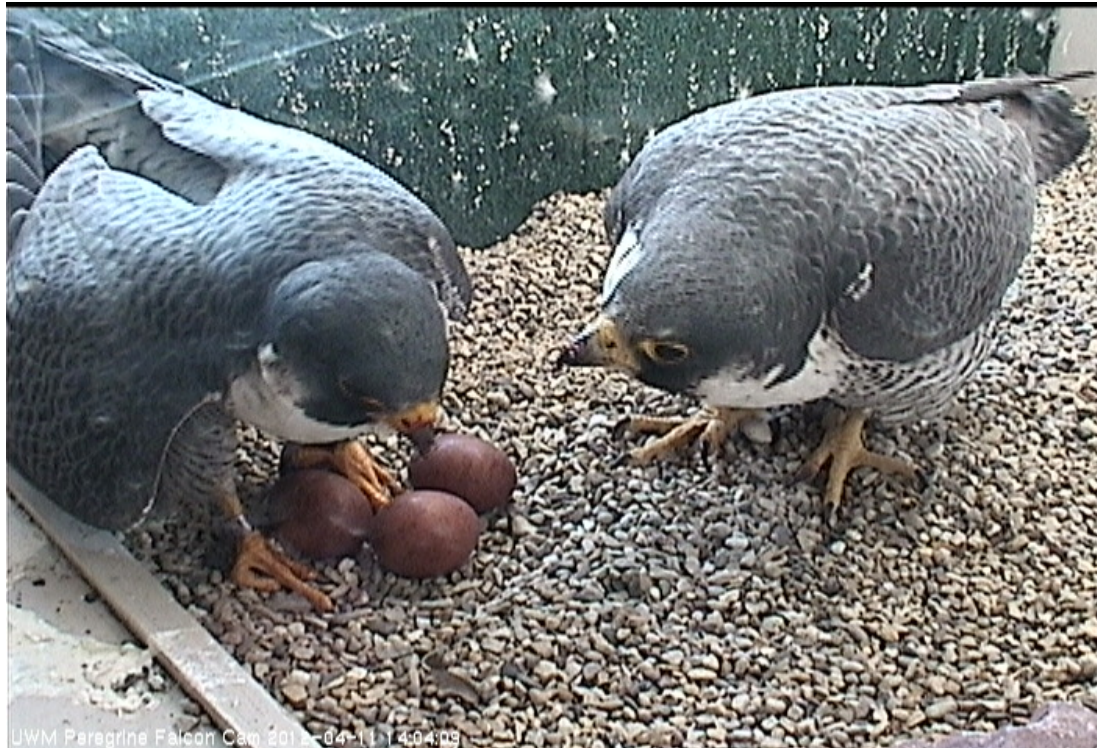
4-24-2012 - Both the male (left) and female (right) have been pulling incubation duty. Anticipated hatch date May 5-7.