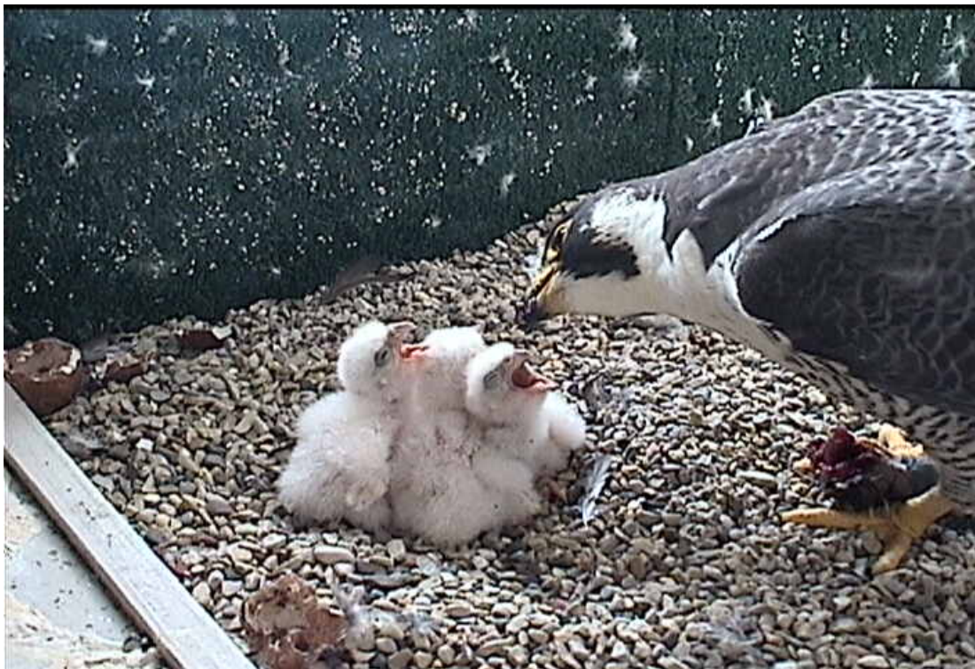
5-7-2012 - Female feeding 3 chicks.