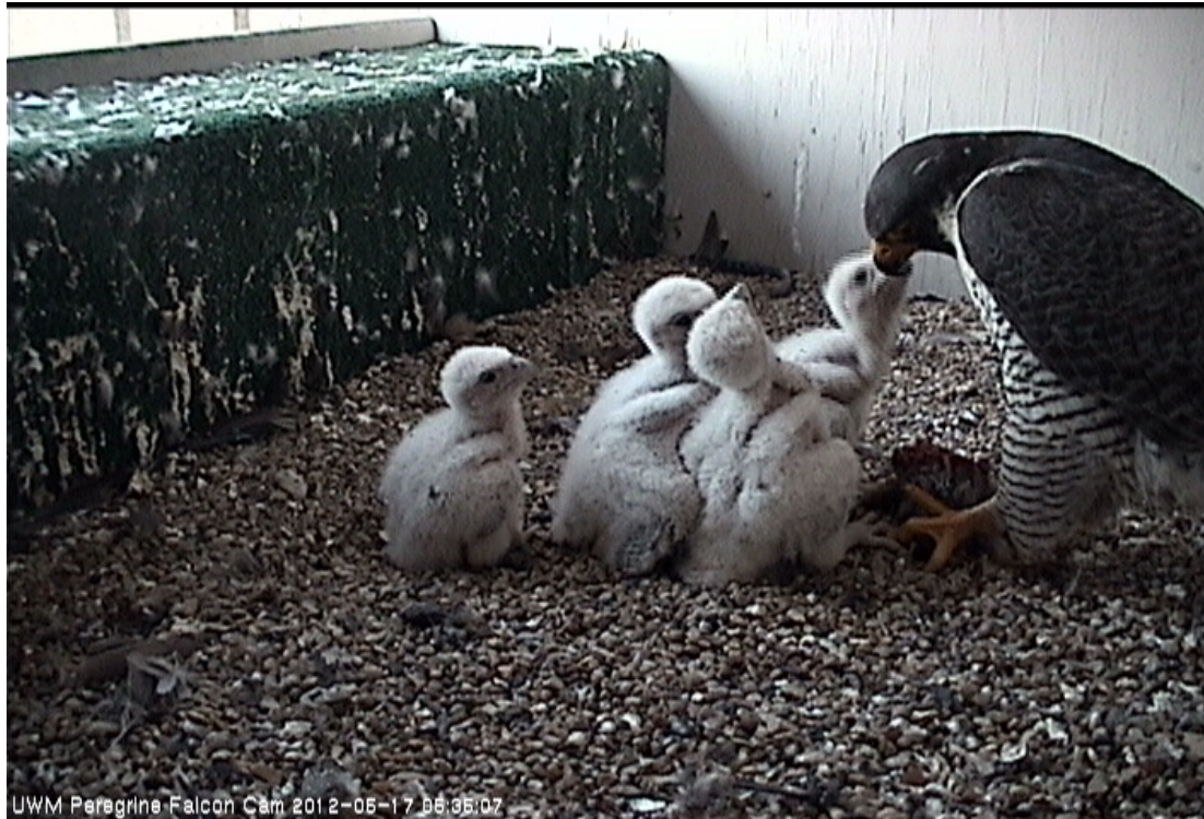
5-17-2012 - An early morning snack.