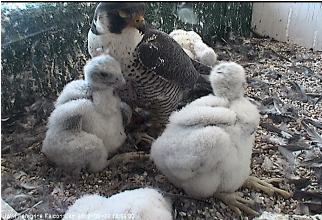
5-23-2012 - Chick are getting quite large now and are actively exploring the nestbox.