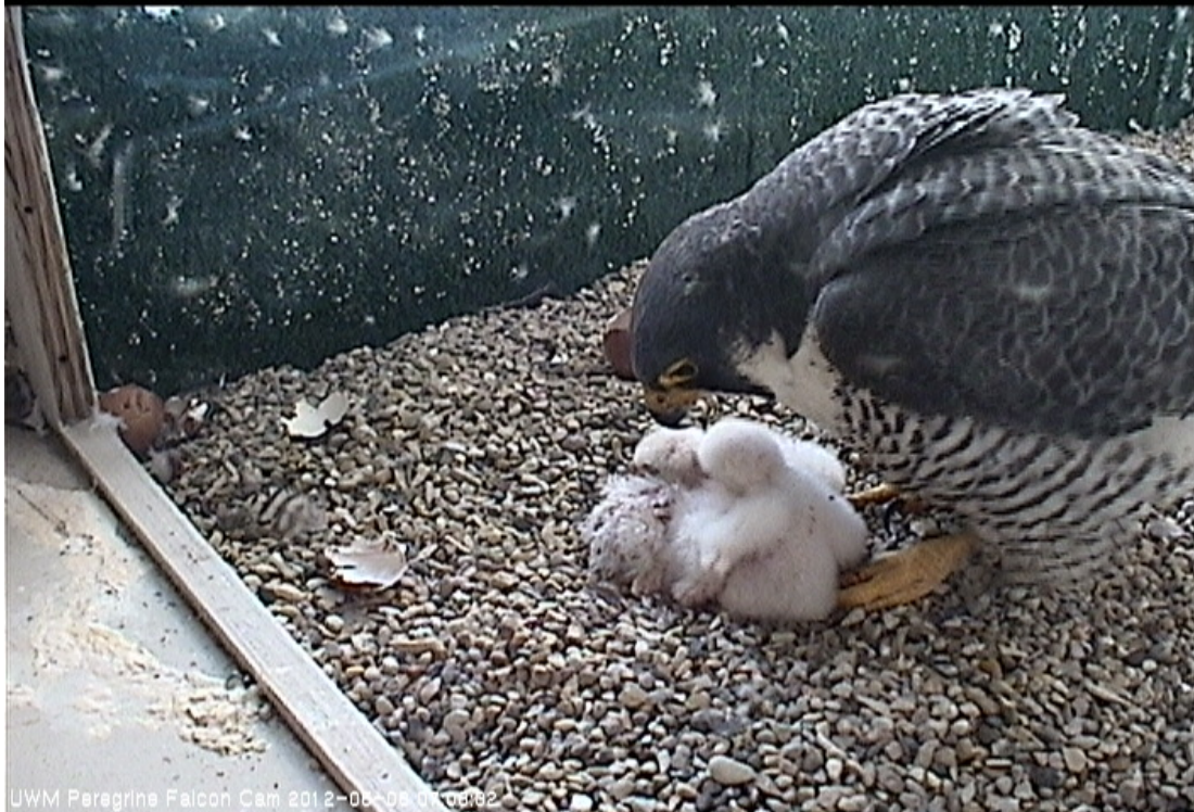
5-8-2012 - 4th chick, seen as the not so fluffy ball at left, hatched early this morning.