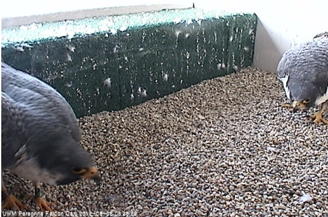
3-8-2012 - Looks like our pair is back from last year, Hoffman and a un-banded female.