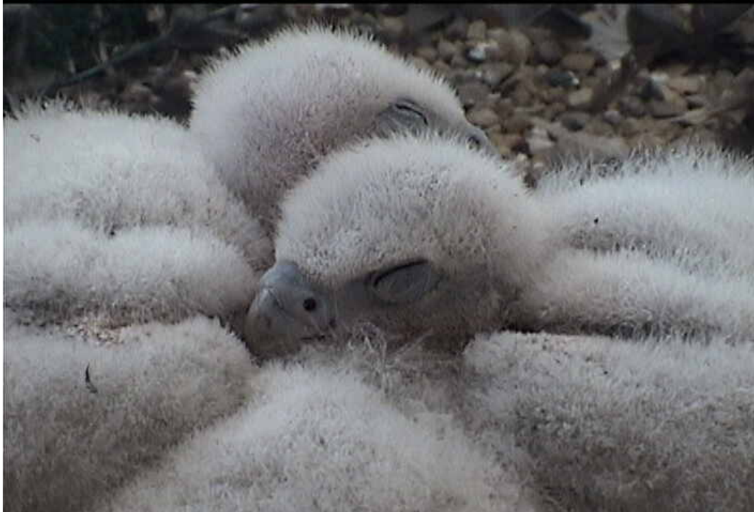
5-18-2012 - Chick head shot.