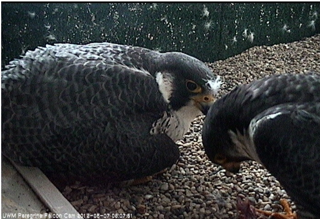
5-7-2012 - Male with food offering to female.