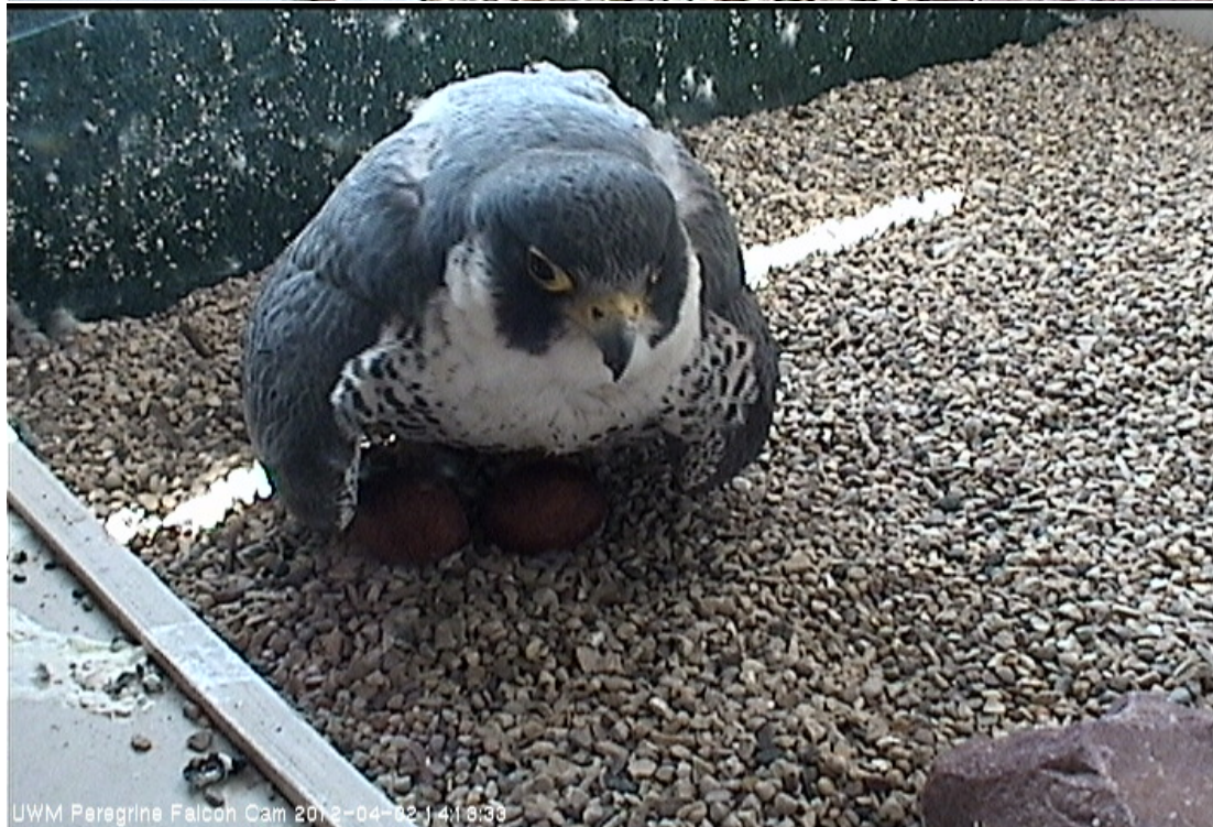
2 photos of the female using her wings for support.