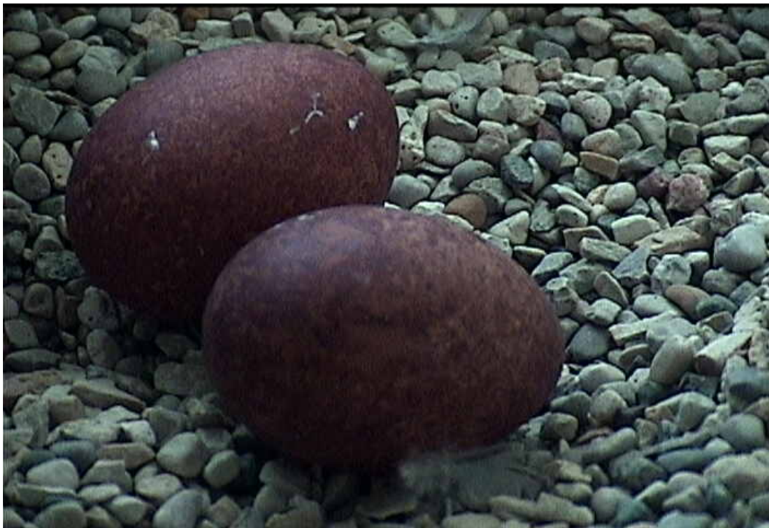
3-31-2012 - 2nd egg was laid about 3:00PM today.