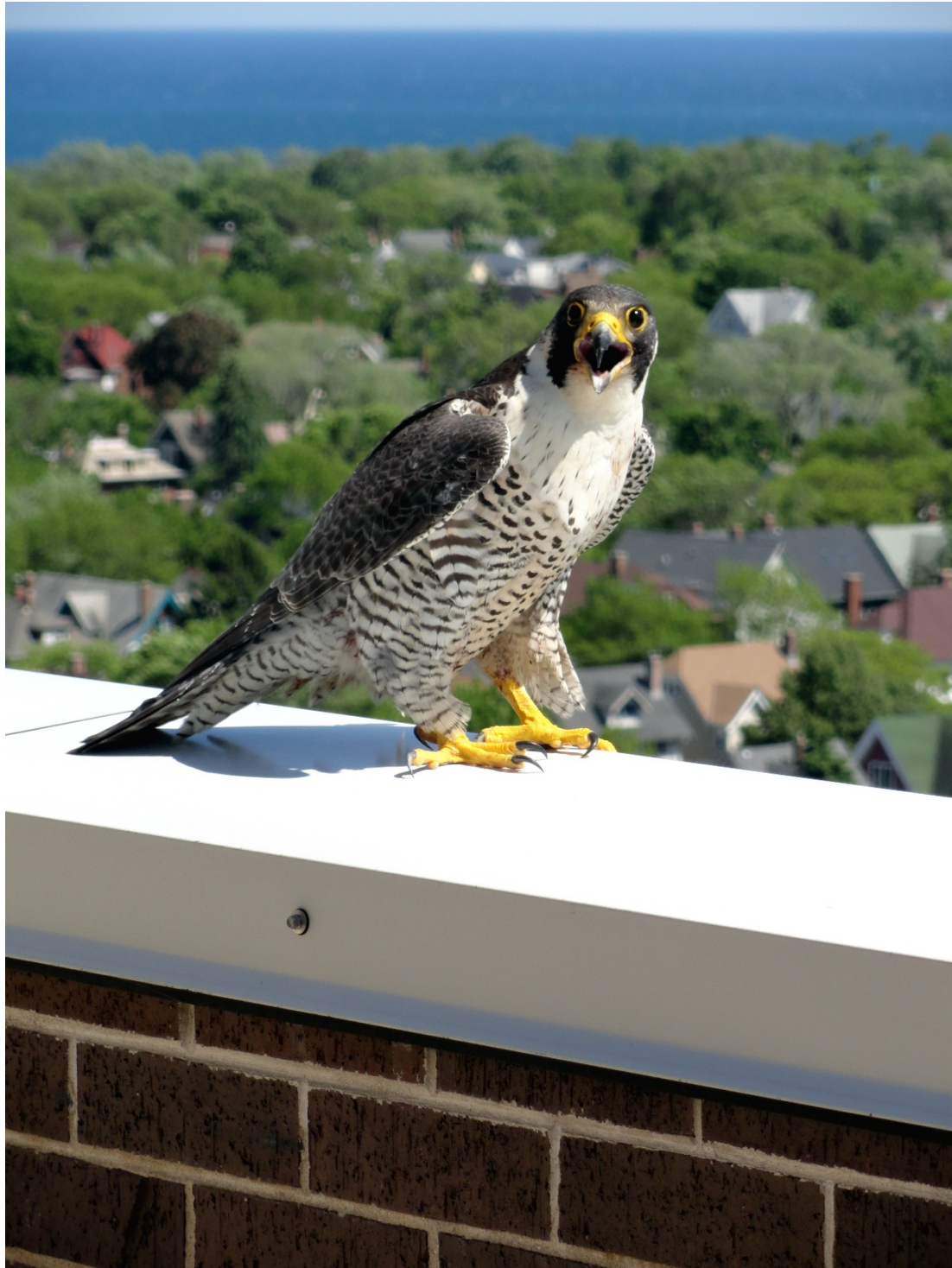
5-29-2012 - Female scolding us while the chicks are returned to the nestbox.