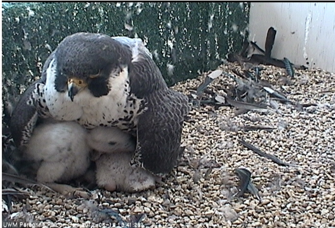
5-18-2012 - They still all fit...