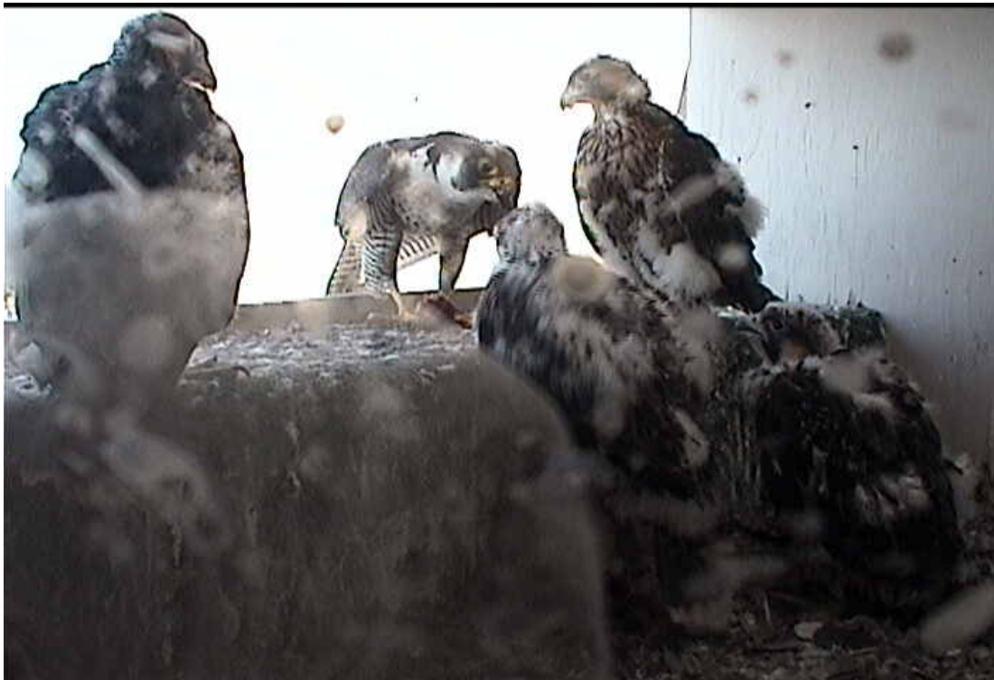
6-8-2012 - Female feeding the growing chicks.