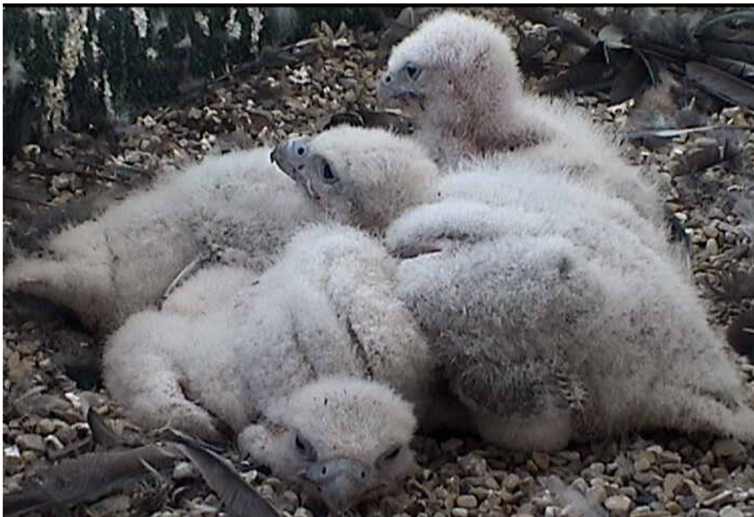
5-18-2012 - Nap time