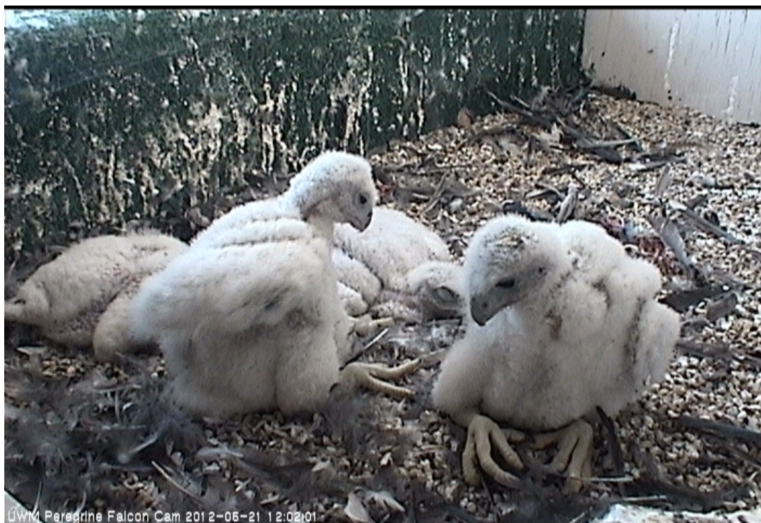
5-21-2012 - Big feet = Big bird.