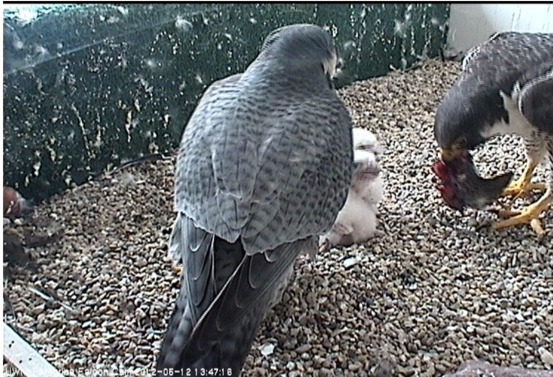
5/12/2012 - Male to the left, female feeding chicks.