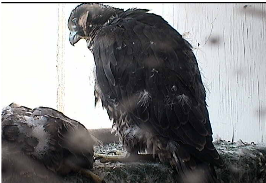
6-10-2012 - Chicks have a good complement of feathers now.