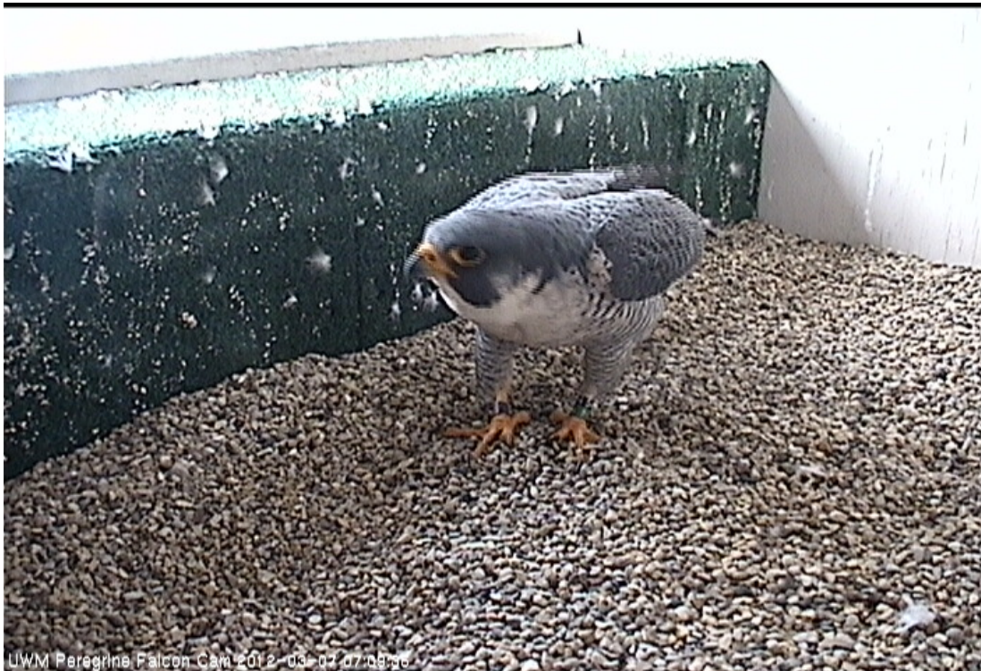
3-7-2012 - Male in the box.