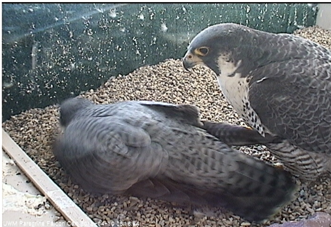
4-10-2012 - Male sitting while the female waits.