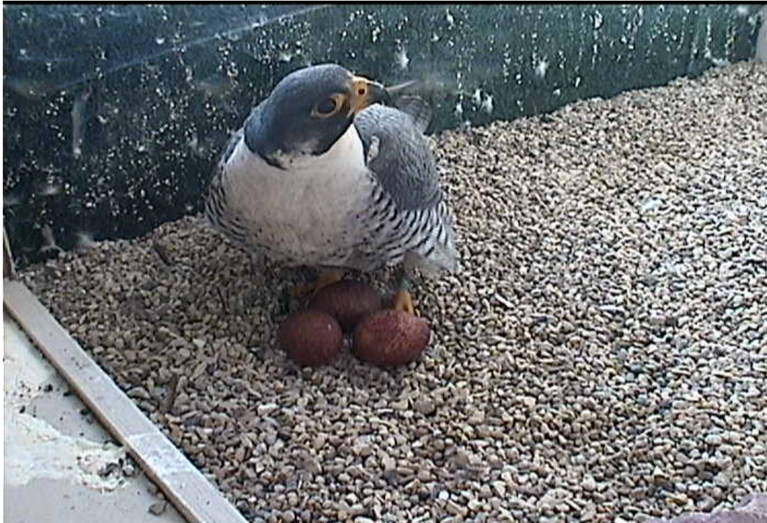
4-3-2012 - 2 photos of the male in to incubate the 3 eggs.