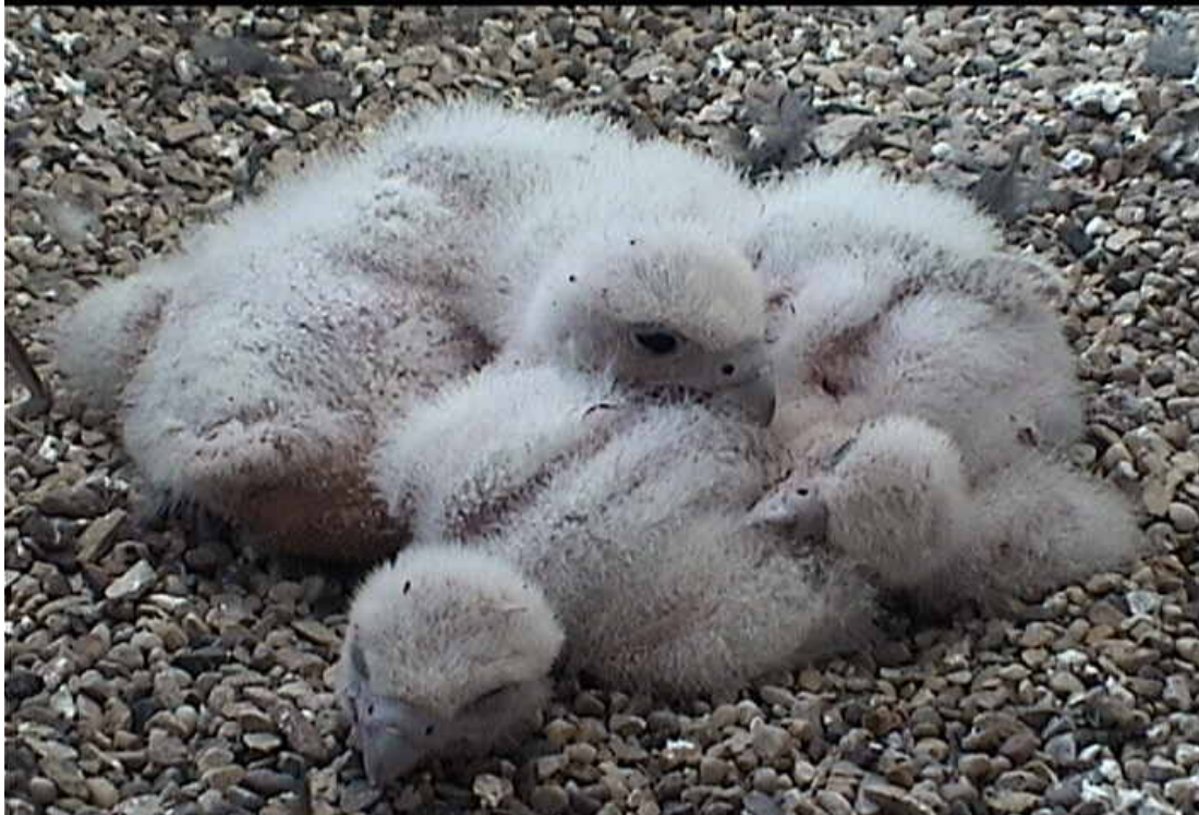
5-15-2012 A chick continuum