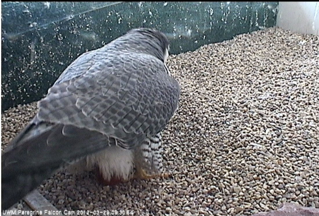
3-30-2012 - First egg was laid today at about 9:30AM. Female covering the egg.