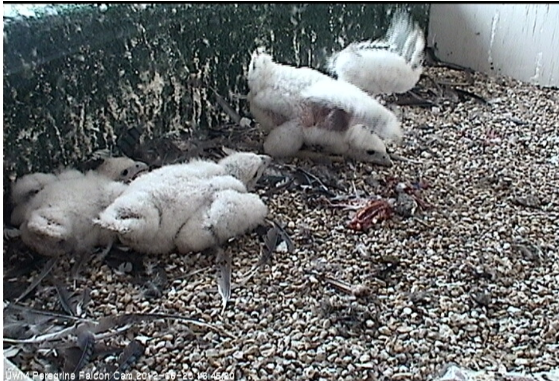
5-20-2012 - A good stretch.