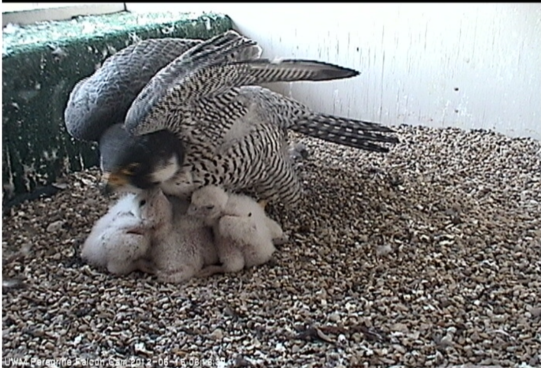
5-15-2012 - A good stretch...