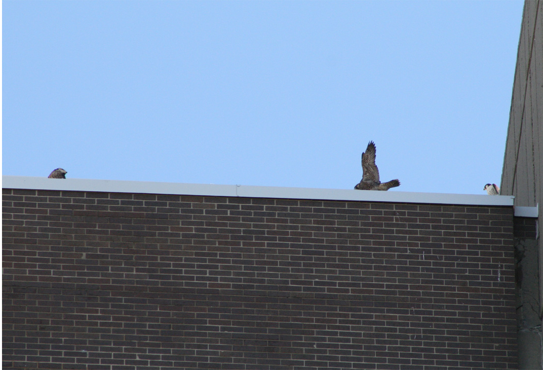
6-17-2012 2 chicks and one adult on top of the EMS Building