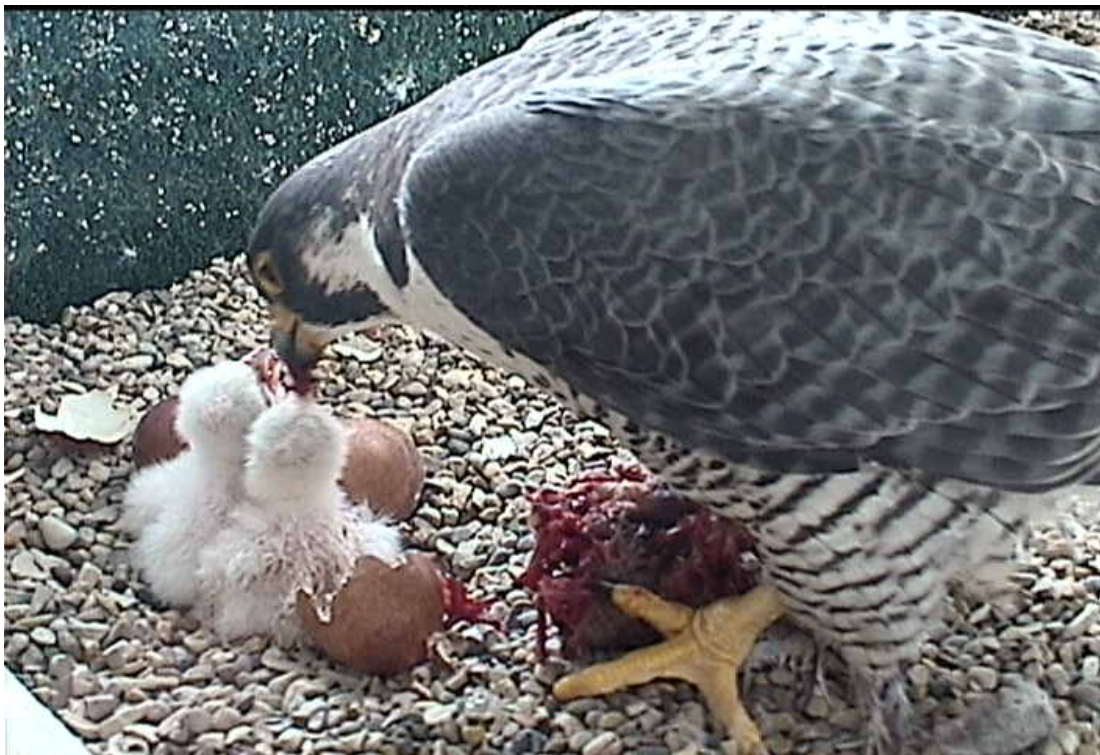
5-6-2012 - We now have 2 chicks hatched. Female feeding.