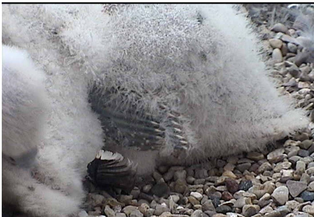
5-18-2012 - Pin feathers are starting to grow in.