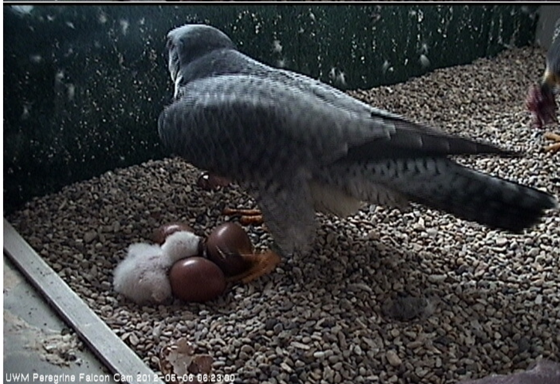
5-6-2012 - The first chick hatched this morning. Female with chick lower photo, male with chick upper photo.