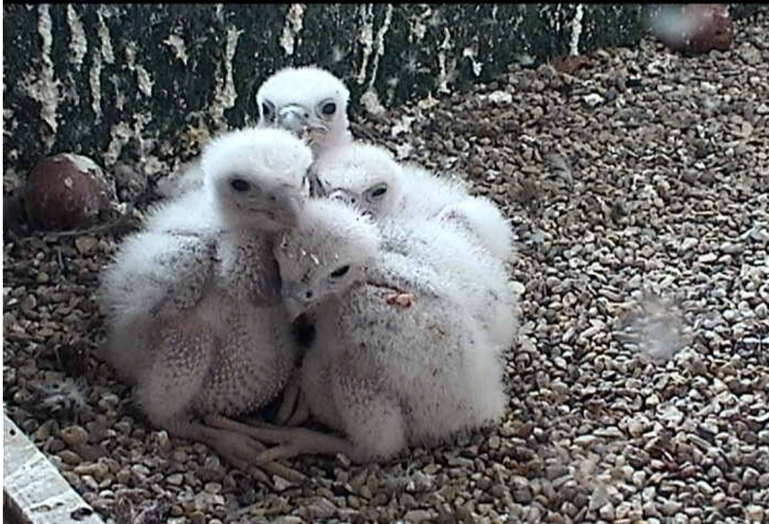
5-21-2013 - Chick are not so cute anymore.