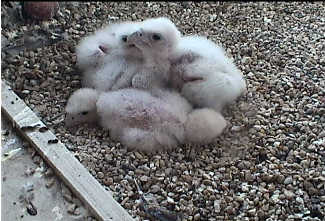
5-20-2013 - 4 chicks.