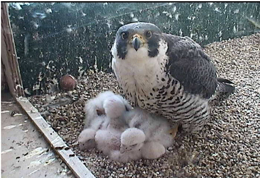
5-20-2013 - Female keeping a close watch on the camera.