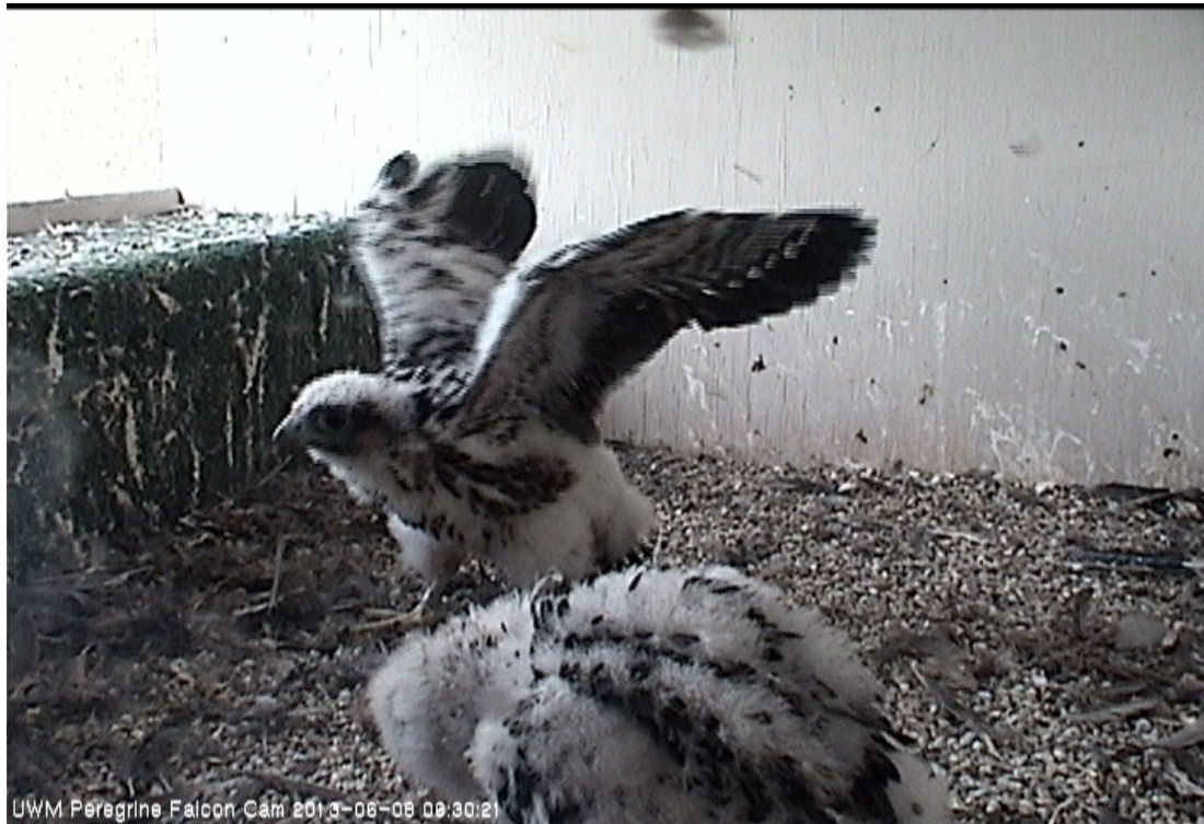
6-8-2013 - Stretching those wings.