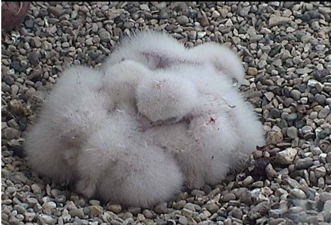
5-15-2013 - Ball of feed and sleeping chicks.