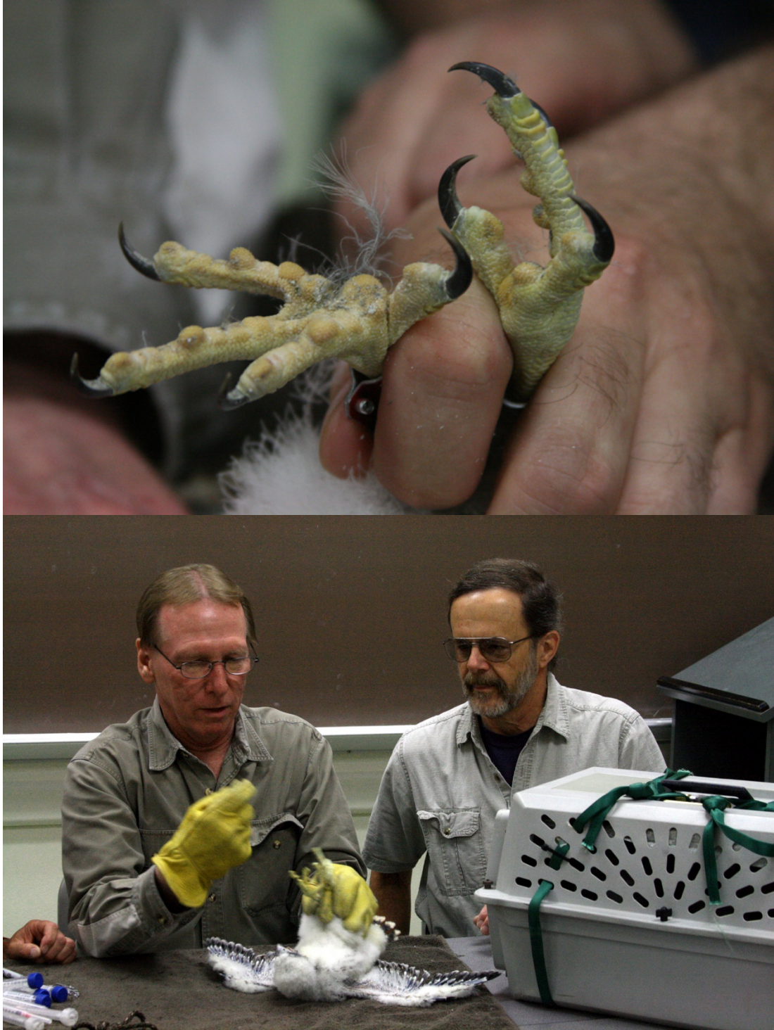
6-3-2013 - Chick receiving identification bands and having a blood draw for DNA work.