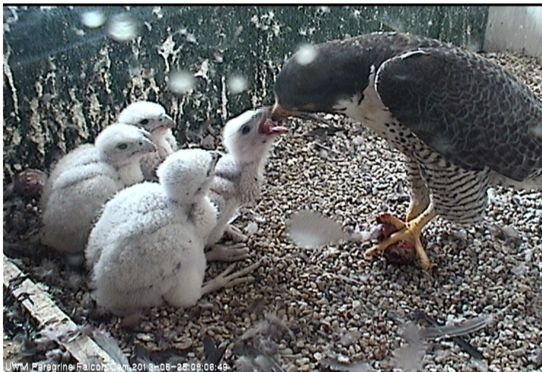
5-25-2013 - 4 chicks being feed.