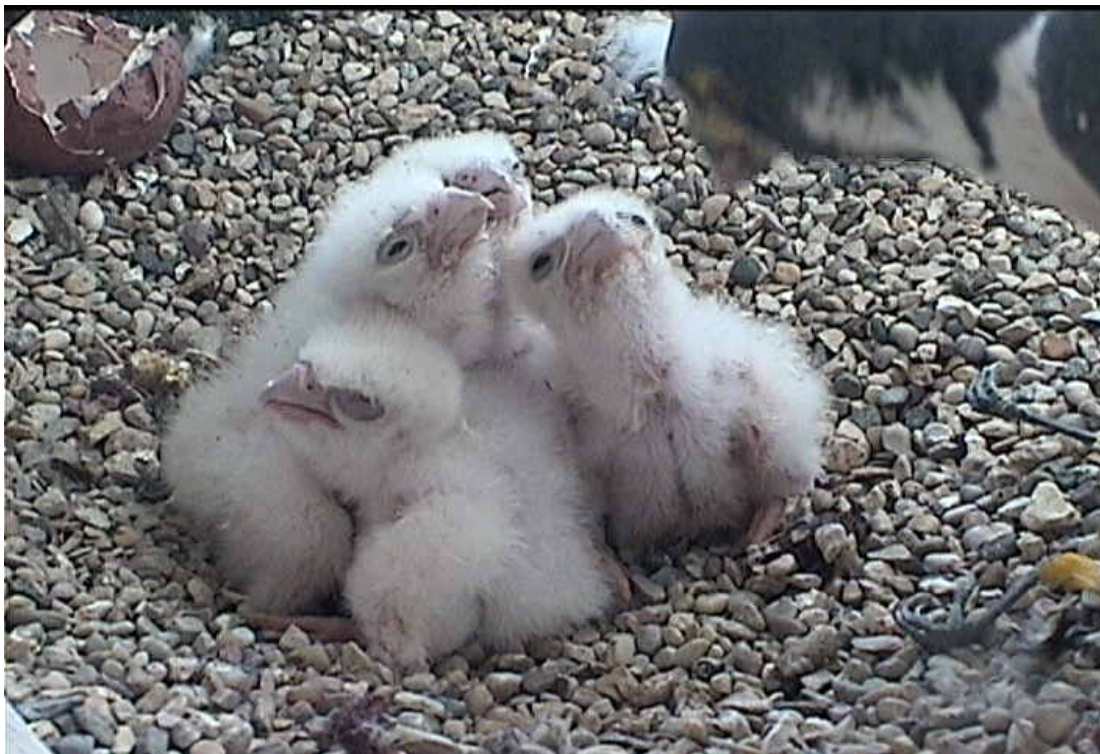
5-15-2013 - The 4th egg has hatched!