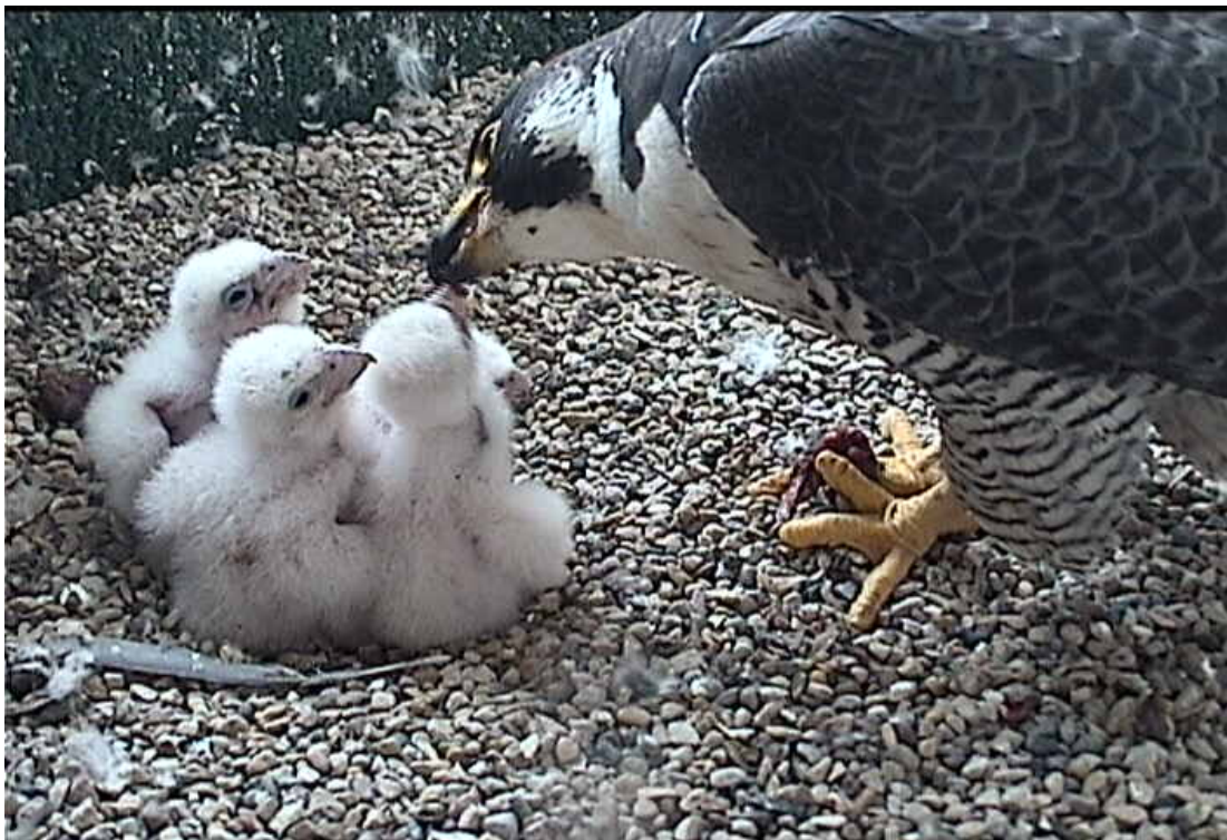
5-17-2013 - Female feeding 4 chicks.