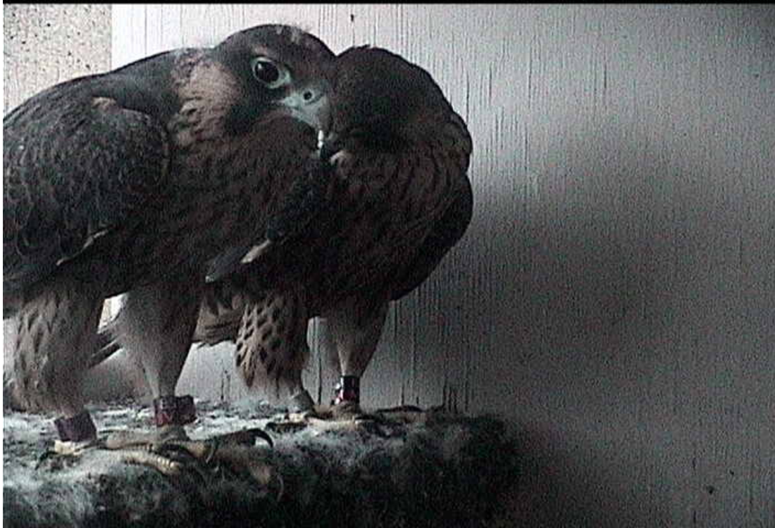
6-24-2013 - Two chicks back in the nest box at dusk.