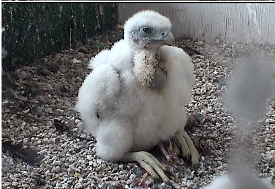
6-1-2013 - Chick close ups.