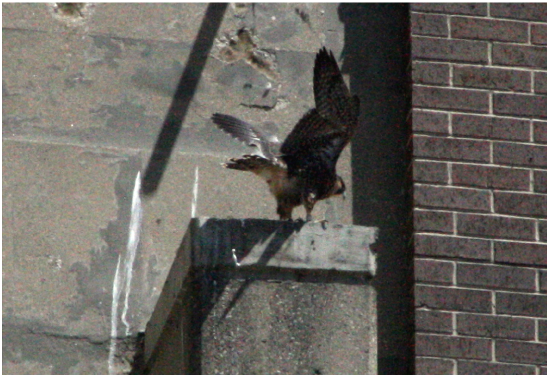
6-19-2013 - Chick on ledge stretching its wings, 13 stories up.