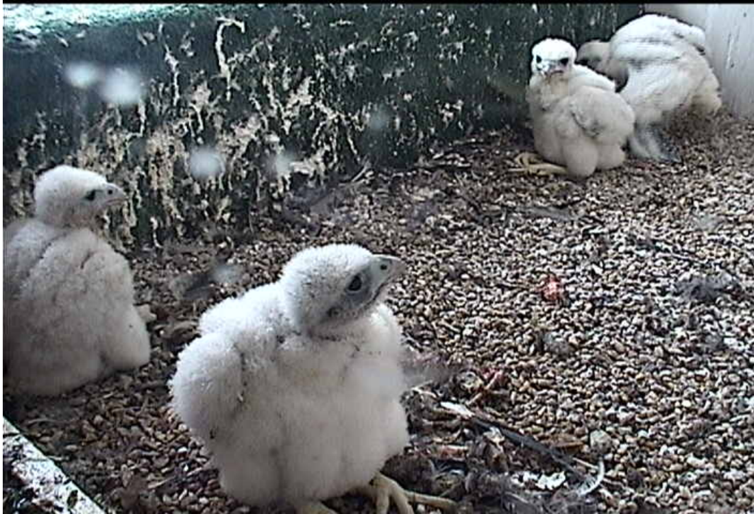
5-28-2013 - Chicks are starting to walk and flex their wings.