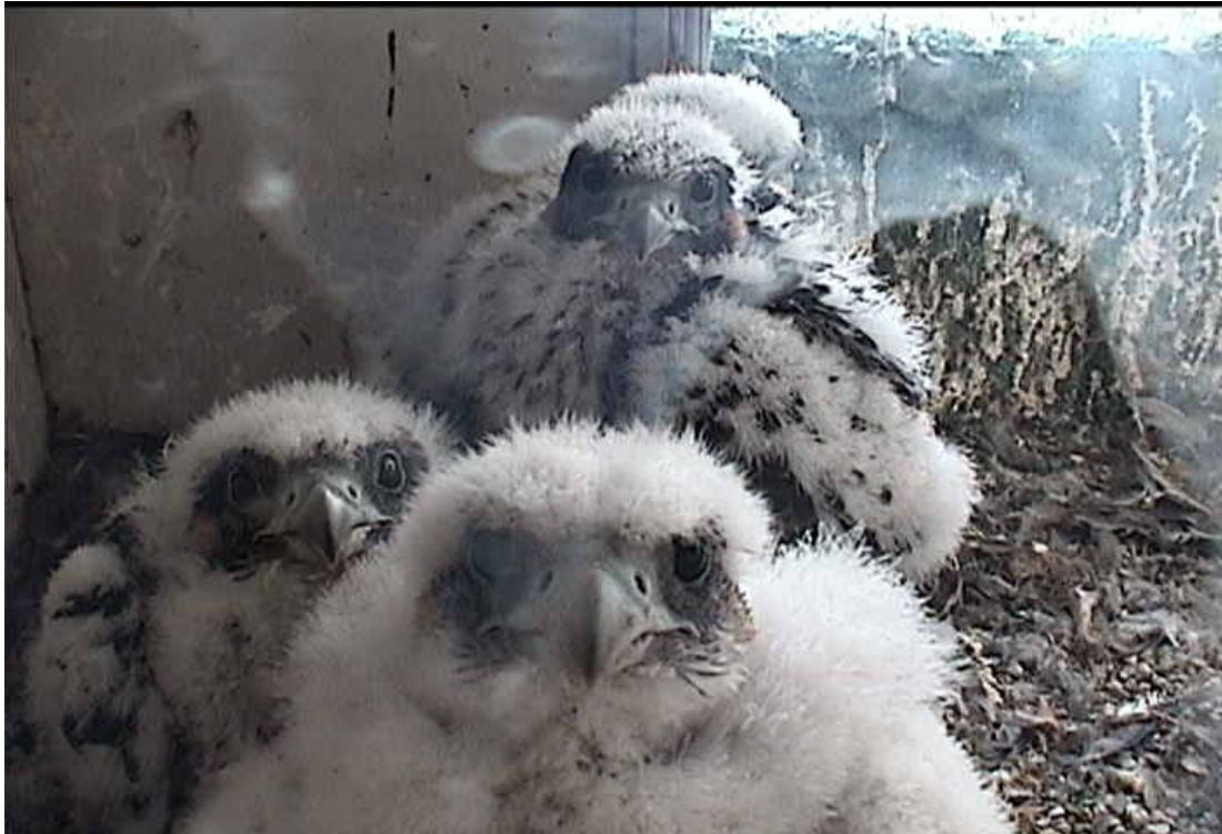
6-8-2013 - Chicks watching the camera.