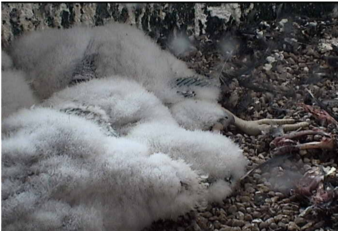
5-28-2013 - Chicks are starting to grow some vaned remiges and rectrices feathers.