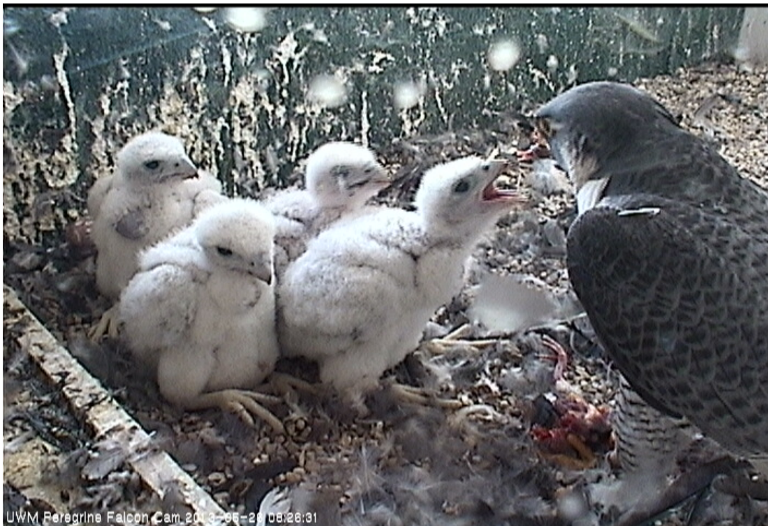
5-26-2013 - The male (Hoffman 54/M B/G) was seen feeding the chicks several times today.