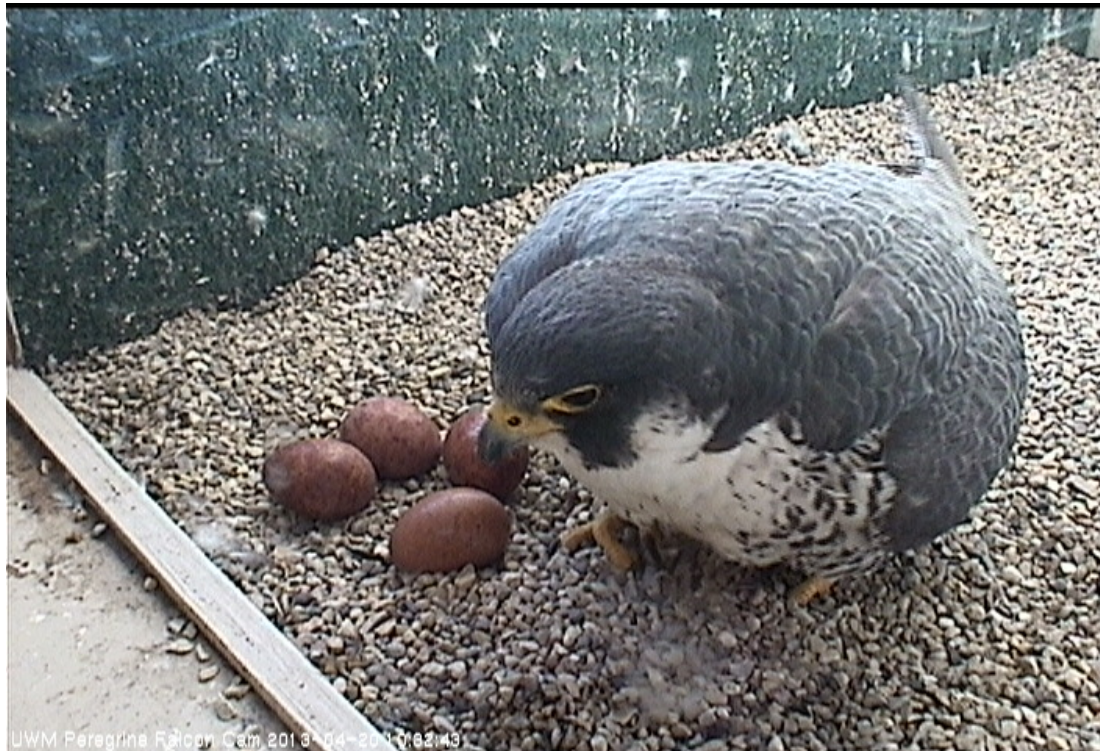
4-20-2013 - Female with 4 eggs.