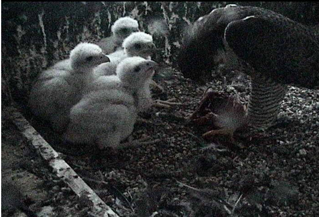
5-27-2013 - Female with a late night, 20:24, snack for the chicks.