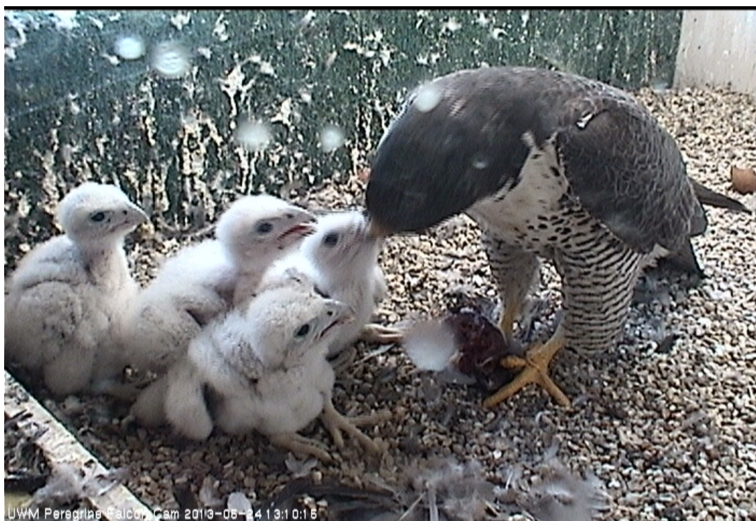
5-24-2013 - The kids are hungry!