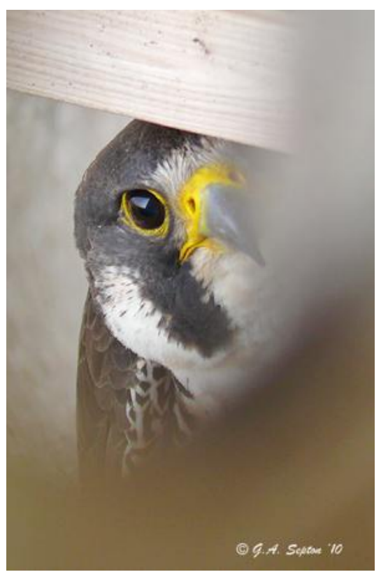
Above: Amylase photographed thru a