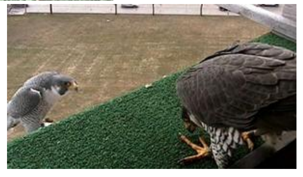
Above : Web cam images showed promise here this spring but 2 of the 3 females ID'd here nested at other Milwaukee area sites.