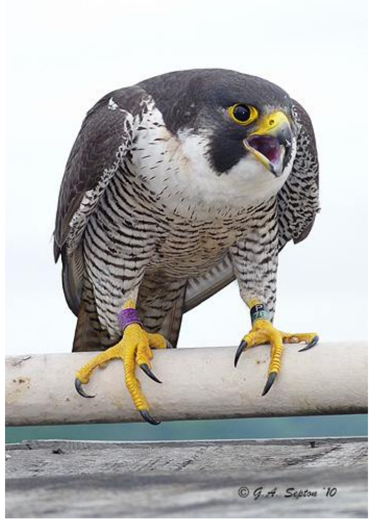
Left: The small, lone male on banding day Above: Nora atop her nest box

Eggs: 4 Laid between April 14 – 20 Projected Hatch Dates: May 22 – 24