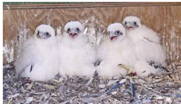
Left: Verne perched on the stack catwalk