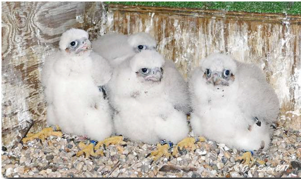
Below: The 4 youngsters on banding day

This site has been active since 2009 producing a total of 35 young (3.9/yr.).