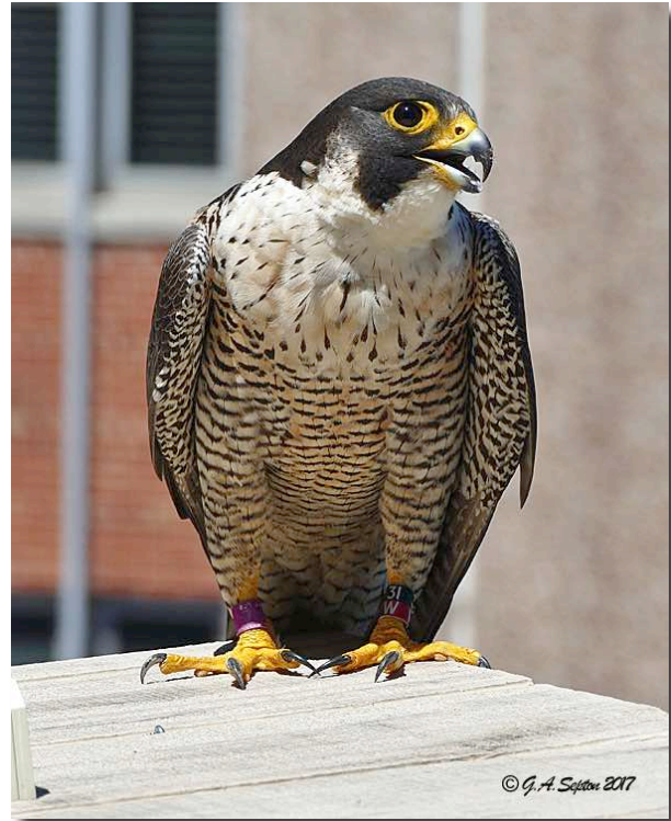
Above: Olympia atop her nest box