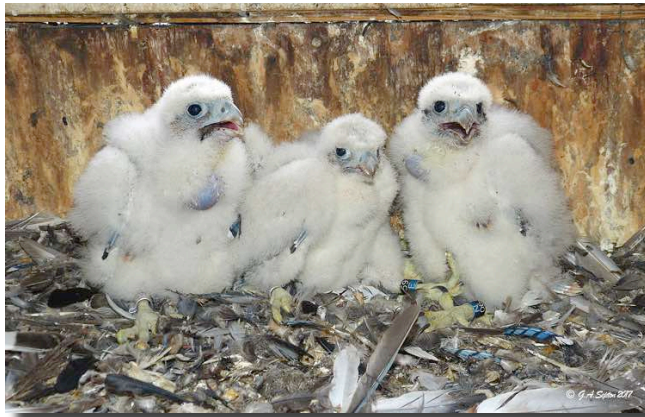
Below: Her 3 youngsters

This site has been active since 2008 producing a total of 29 young (2.9/yr.).