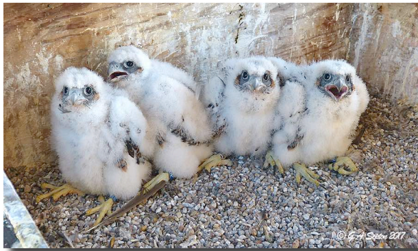
Below: Her 4 young after banding

This site has been active since 2013 producing a total of 17 young (3.4/year).