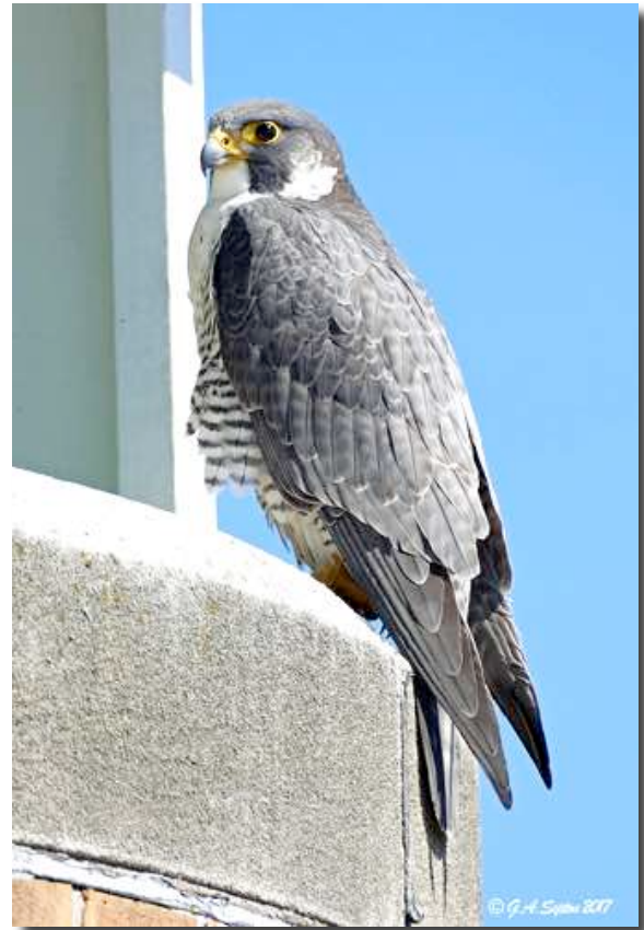
Above: The unbanded adult female peregrine at Milwaukee's Miller Coors nest site

We Energies Wisconsin Energy Foundation US Bank-Milwaukee Malteurop North America, Inc. Veolia Water Miller Coors Brewing Briess Malt & Ingredient Co. Wisconsin Power & Light Wisconsin Public Service Raptor Education Group, Inc. The Raptor Center Alliant Energy Raptor Resource Project Fellow Mortals Madison Gas & Electric Wheaton Franciscan Hospitals United Hospital System Valero Renewables Pineview Wildlife Rehab Center St. Josephs Hospital - Milwaukee Kenosha Medical Center Milwaukee Regional Medical Center - Thermal Ever-Green Energy, LLC Proctor & Gamble Paper Products S.O.A.R Sports Turf Warehouse Racine County Thilmany Mill ThyssenKrupp STCP Ltd Georgia Pacific USDA UW - Milwaukee UW - Oshkosh UW - Green Bay WI DNR WI DOT Wildlife in Need Center Wildlife of Wisconsin Willowbrook Wildlife Haven AVES Wisconsin Humane Society Dominion Energy Wausau Paper Wisconsin Falconers Association Wisconsin Society for Ornithology