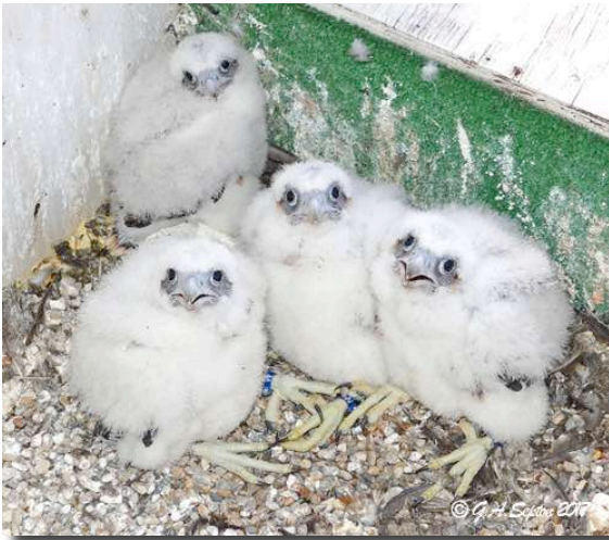
Below: Banding day

This site has been active since 2011 producing a total of 24 young (3.42/year).