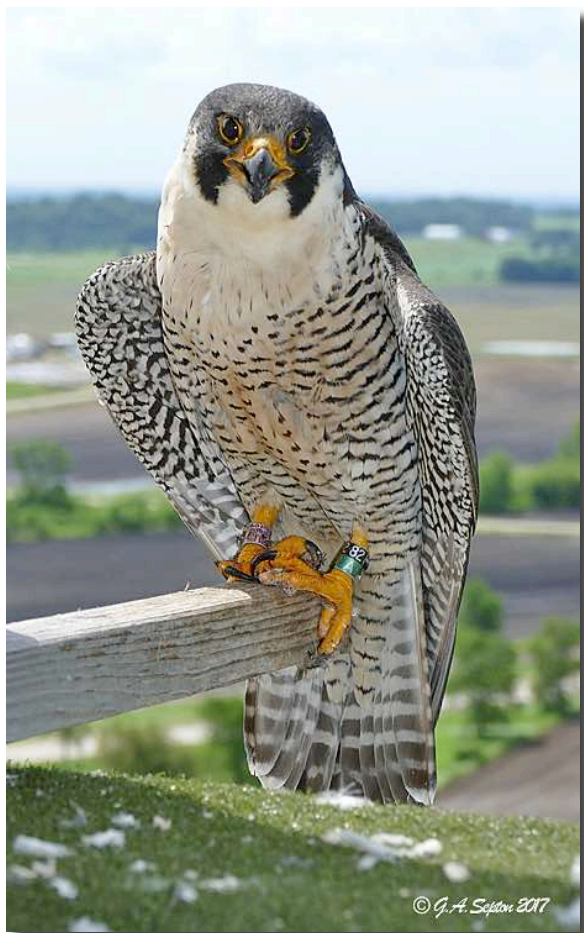
Above: Smokey at her nest box