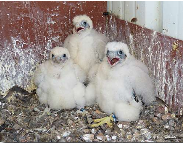
Below: Her 3 young after banding

This site has been active since 2006 producing a total of 28 young (2.33/yr.).