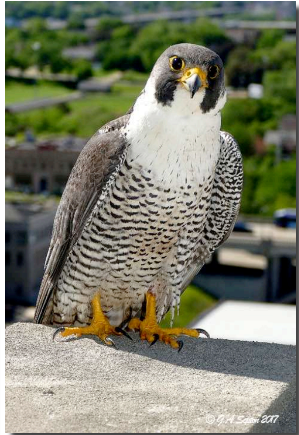
Above: The unbanded female