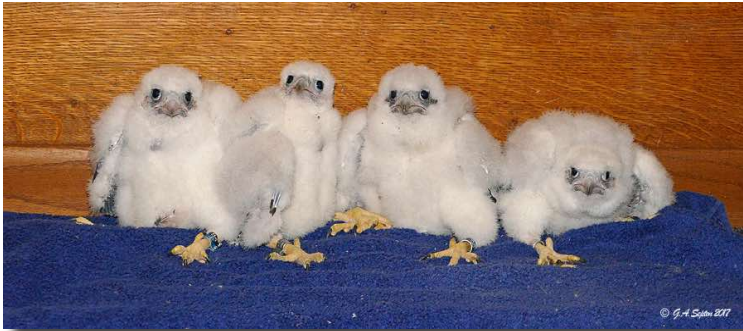
Below: Her 4 youngsters

This site has been active since 1998 producing a total of 63 young (3.15/year).