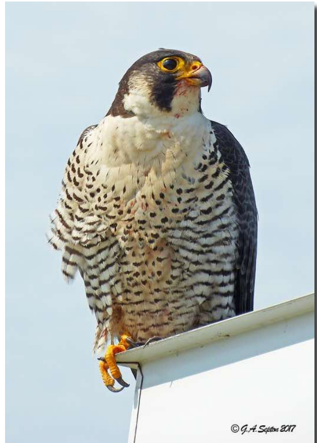
Above: The unbanded adult female