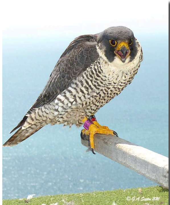
Above: Eclipse at her nest box

Note: All 4 young died in the nest box between 5/10 – 11 and were carried out and removed by the adults.