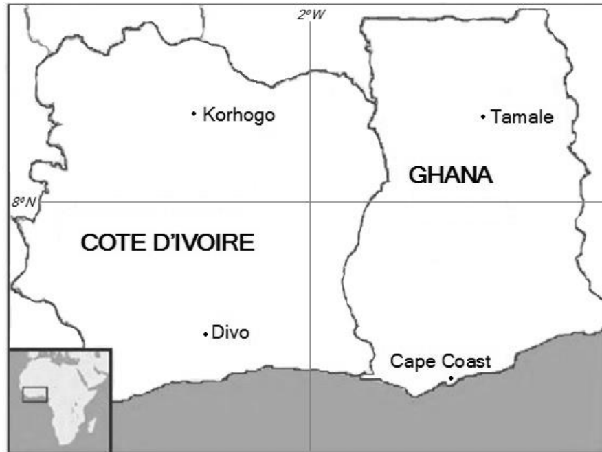
FIGURE 1. Map of the Research Locations.