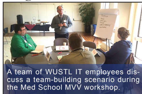
A team of WUSTL IT employees discuss a team-building scenario during the Med School MVV workshop.

In a post-workshop survey, participants reported that networking with new people, collaborative opportunities and gaining new knowledge were their top three takeaways.