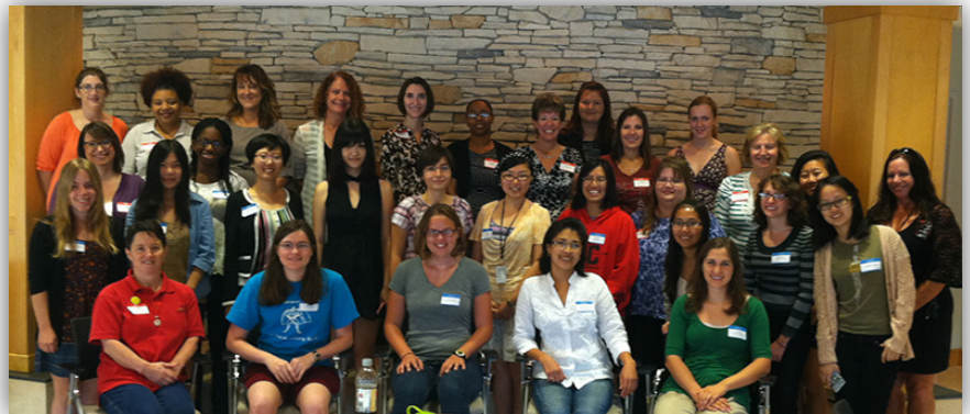
SPIN-IT Mentor Meet & Greet Breakfast, Oct.

Continuation of the SPIN-IT program has been approved for 2014. The program has been expanded to include men participants as well. Applications will be accepted in late January 2014.