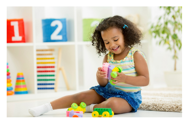
systematic curriculum of "educational games" emphasizing language development and cognitive skills.