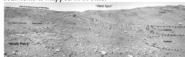
Figure 2. Rocks on West Spur (Sol 191 Pancam P2390).

[2] developed two different models for the alteration mineralogy of Clovis class rocks, reflecting the possibilities of moderate and extreme aqueous alteration. Fe is present in the form of nanophase oxides (np-Ox), goethite, hematite, as well as in residual pyroxene whose abundance depends on the degree of alteration. Significant alkali feldspar is present in the moderately altered model, while secondary aluminosilicates dominate in the heavily altered one. After removing the % of ions associated with salts and Fe-oxides/hydroxides, all West Spur rocks form a linear trend similar to chemical weathering trend of terrestrial plutonic and volcanic rocks [6]. Corundum-normative mineralogies of most West Spur outcrops and rocks also suggest the presence of secondary aluminosilicates such as allophane, amorphous silica, phyllosilicates, and zeolites [2]. Phyllosilicates were not detected directly in Clovis class rocks by instrument payload of Spirit; however, Wang et al [6] suggested that kao-