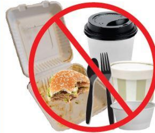
NO FOOD/LIQUIDS TO-GO BOXES PAPER CUPS