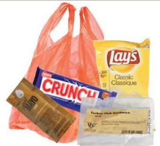
SNACK WRAPPERS SOFT PLASTICS & BAGS