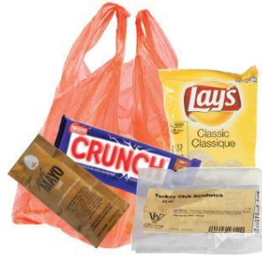
SNACK WRAPPERS SOFT PLASTICS & BAGS