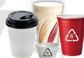
PLASTIC #6 PAPER CUPS STYROFOAM