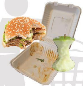
FOOD/LIQUIDS TO-GO BOXES