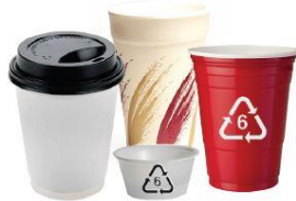
PLASTIC #6 PAPER CUPS STYROFOAM