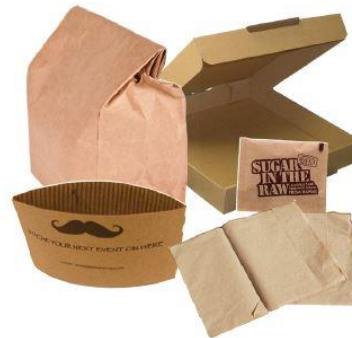
BROWN, UNCOATED PAPER PRODUCTS