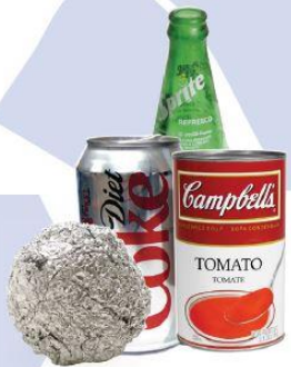
METAL & GLASS