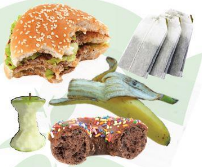
FOOD & LIQUIDS