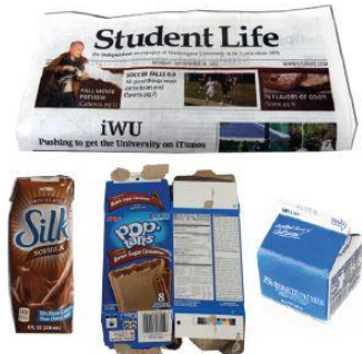
PAPER, CARTONS & CARDBOARD