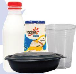
PLASTICS NO #6 OR BAGS