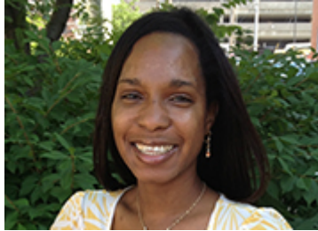
Welcome New Staff

For more information on PECaD Community Outreach , please contact PECaD at (314) 747-4611 or pecad@wudosis.wustl.edu .