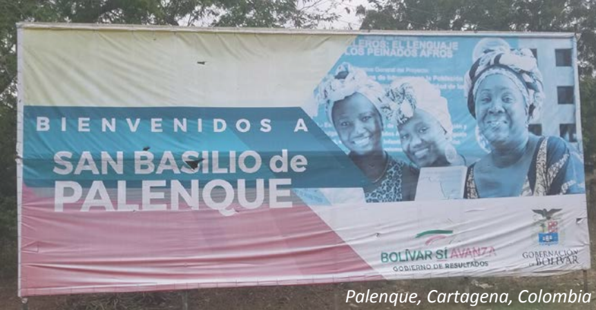
Palenque, Cartagena, Colombia

- Tourism Industry Association of Canada and Parks Canada