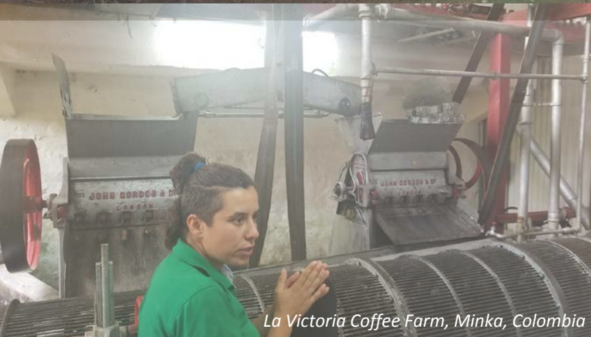
La Victoria Coffee Farm, Minka, Colombia