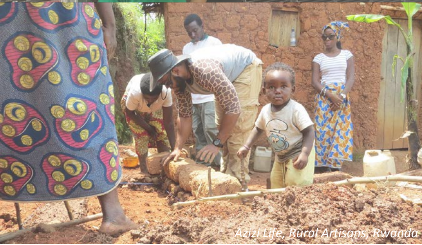
Azizi Life, Rural Artisans, Rwanda