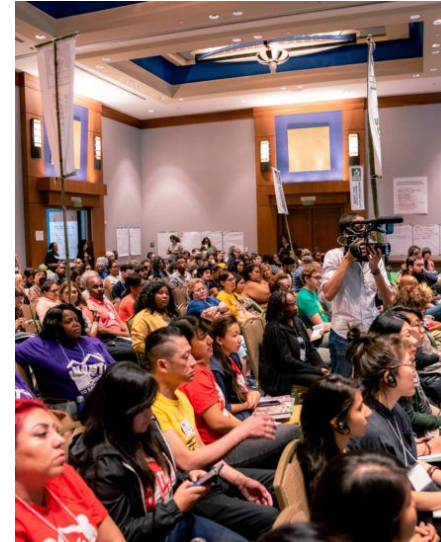
Left- housing and land justice organizations at the Right to the City and Neighborhood Funders Group at the Atlanta Convening, July 2018