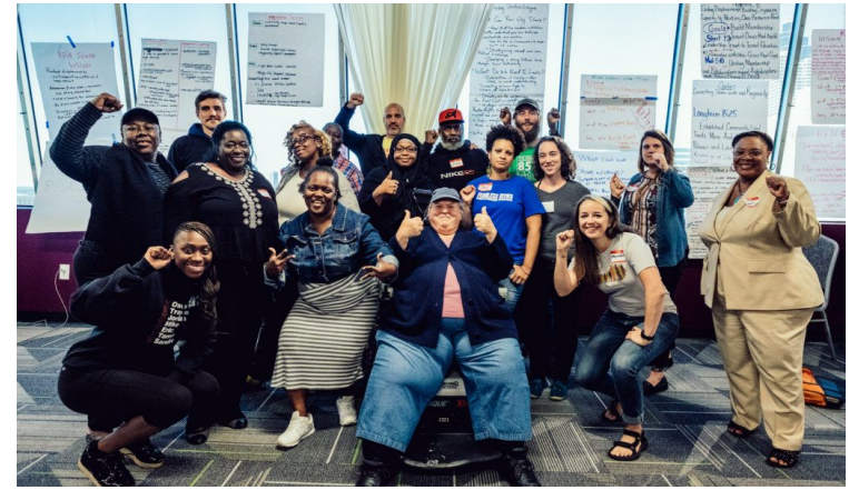
Above- members of Homes for All South at their inaugural convening, October 2017