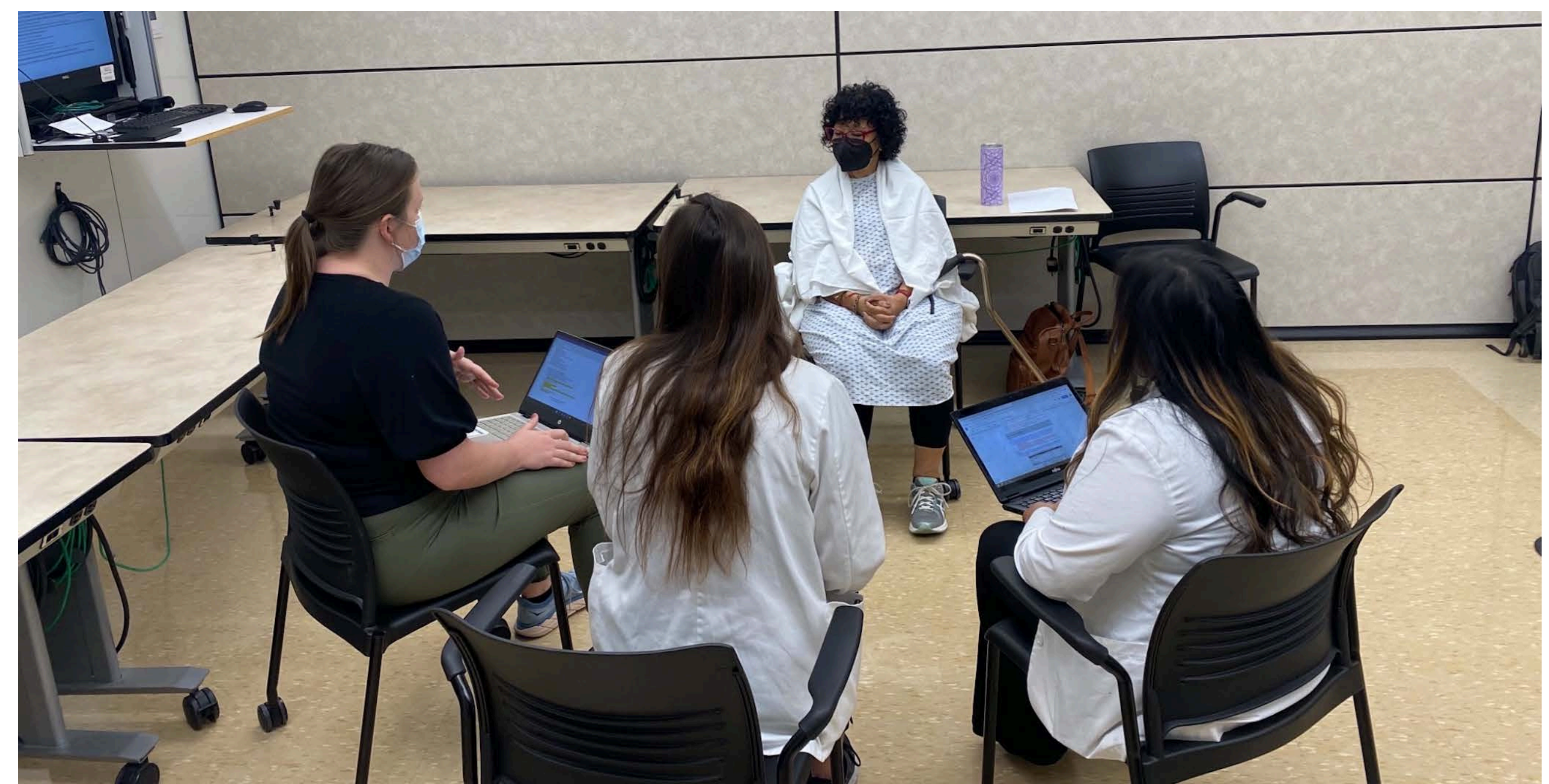
An interprofessional team of learners meeting with their standardized patient in October 2022, discussing the options for discharge from post-stroke hospital stay