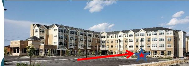
Photo of: 8 Millstone Campus Dr. Covenant Place II Cahn Family Building