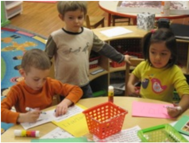
Writing work on our invitations

In the Art Area, friends drew in crayon and painted over their creations in watercolors to create crayon resist creations. Painting with fruits and vegetable to create prints followed. The writing area provided space for the children to create invitations for parents and families to announce our Big Bear plays. We measured, compared, mixed play-doh, built parking garages and rocket ships, set up stores and sold food, all in the course of a typical week.