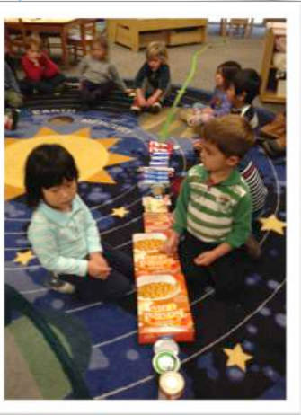
Thank you for your food donations for Operation Food