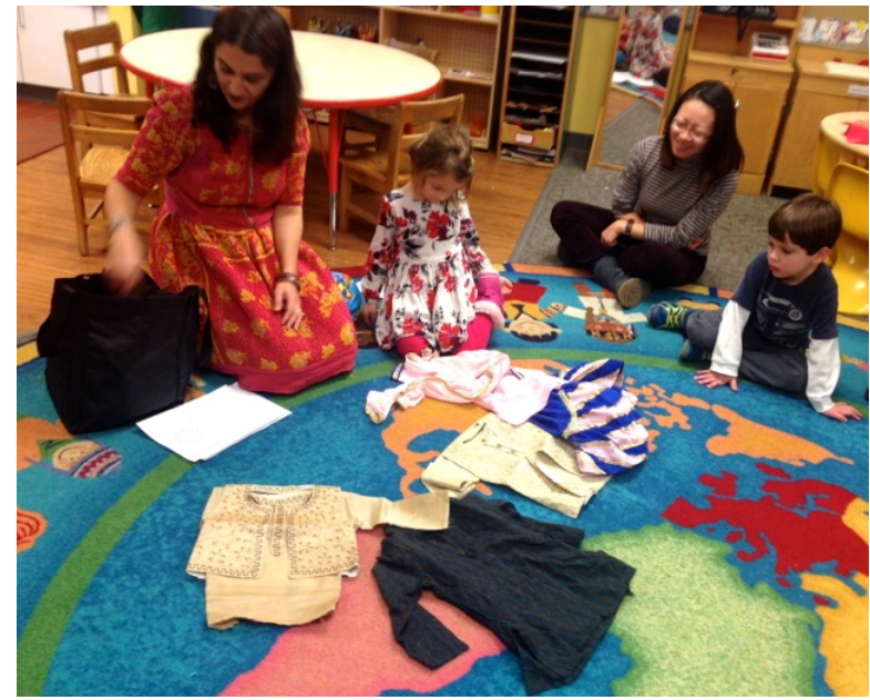
Untíl 2017, Míss Colleen & Míss Katíe