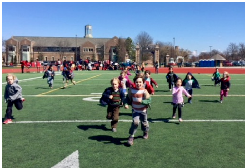
Sun Bears running the “length of a blue whale”—100 feet.