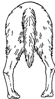
Wide or Bandy