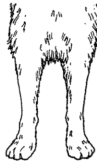
Narrow in Front and East-West Feet