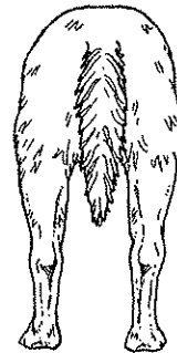
Correct, Straight, Normal