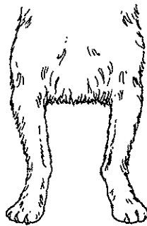
Fiddle Front or Chippendale