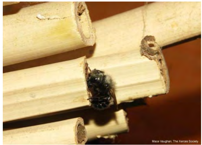
A mason bee closing the entrance to her nest with mud after laying a series eggs in the tube.

MATERIALS: While in most cases native plants are preferred, non-native ones may be suitable for some applications, such as annual cover crops, buffers between crop fields and adjacent native plantings, or short-term low cost insectary plantings that also attract beneficial insects which predate or parasitize crop pests. For more information on suitable non-native plants for pollinators, see Table 4.