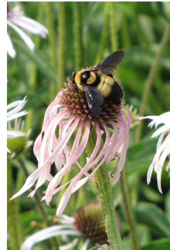
Bumble bee ( Bombus fraternus ) on pale purple coneflower ( Echinacea pallida ).

Keep in mind that small bees may only fly a couple hundred yards, while large bees, such as bumble bees, easily forage a mile or more from their nest. Therefore, taken together, a diversity of flowering crops, wild plants on field margins, and plants up to a half mile away on adjacent land can provide the sequentially blooming supply of flowers necessary to support a resident population of pollinators.