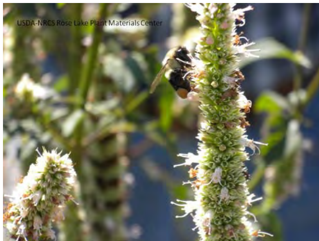
Common Eastern bumble bee ( Bombus impatiens ) on giant yellow hyssop ( Agatache nepetoides ).

This technical note provides information on how to plan for, protect, and create habitat for pollinators in agricultural settings. Pollinators are an integral part of our environment and our agricultural systems; they are important in 35% of global crop production. Animal pollinators include bees, butterflies, moths, wasps, flies, beetles, ants, bats, and hummingbirds. This technical note focuses on native bees, the most important pollinators in temperate North America, but also addresses the habitat needs of butterflies and, to a lesser degree, other beneficial insects.