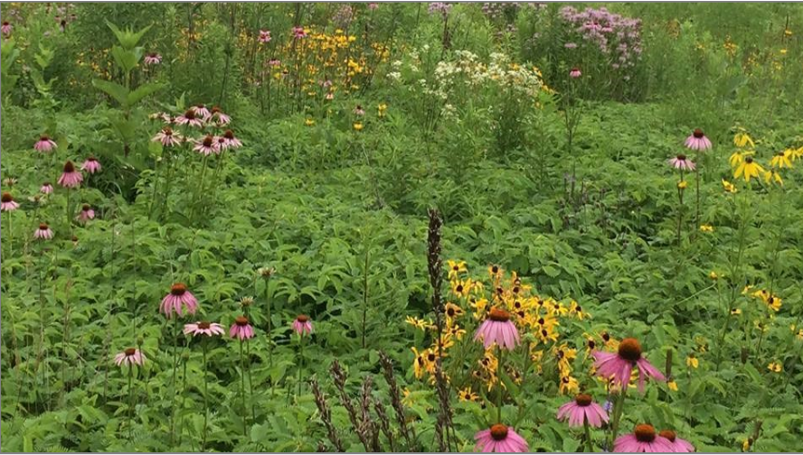
Pollinator Planting

Pollinator plantings are a great way to improve pollinator habitat and biodiversity. Planting native herbaceous and woody species that are beneficial to pollinators throughout the landscape will prove to not only be attractive to pollinators, but also aesthetically pleasing to the eye and attractive to many other species of wildlife.