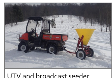
UTV and broadcast seeder

Broadcast: This method requires bare ground, which usually means tillage and leveling is needed to prep the site prior to planting. It is best to use a broadcaster that agitates the seed. However, most broadcast equipment does not mix or agitate the seed to achieve even seed distribution. So, care must be taken to broadcast fluffy seed separate from small seeds. A carrier (i.e. pelletized lime, gypsum, or other) may be added to help bulk up and spread the seed mix. It is best to press the seed into the soil with a cultipacker or roller to achieve good seed-to-soil contact. This step is not necessary if frost seeding (seeding onto frozen or snow covered soil). The freezing and thawing action will incorporate