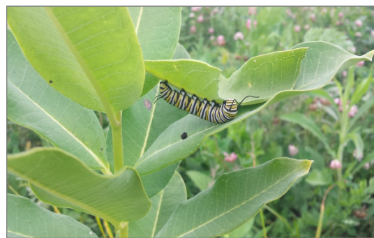
Monarch caterpillar foraging on C. milkweed

#3 Site Preparation: Site preparation is one of the most important and often inadequately addressed components for project success. Too often this step is rushed resulting in poor establishment along with weed control problems. It is very important to address this step with planning and patience . Site preparation steps depend on existing vegetation growing on the site. Sites with minimal weed pressure (i.e. cropland - soy bean stubble) usually requires less site prep (herbicide applications, mowing & time) than sites that are heavily vegetated with undesirable vegetation (i.e. old pasture with herbaceous and woody perennial plants).