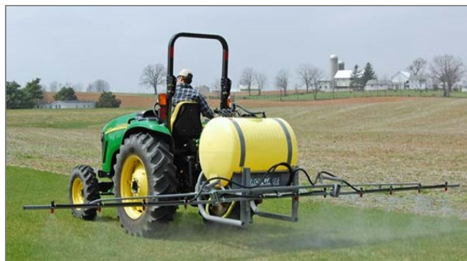
Herbicide application with a boom sprayer

#3 Site Preparation: Site preparation is one of the most important and often inadequately addressed components for project success. Too often this step is rushed resulting in poor establishment along with weed control problems. It is very important to address this step with planning and patience . Site preparation steps depend on existing vegetation growing on the site. Sites with minimal weed pressure (i.e. cropland - soy bean stubble) usually requires less site prep (herbicide applications, mowing & time) than sites that are heavily vegetated with undesirable vegetation (i.e. old pasture with herbaceous and woody perennial plants).