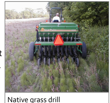
Native grass drill

Drill: Truax and Great Plains are two equipment manufacturers that make a no-till drill capable of sowing both fluffy and small seeds. This method requires minimal site prep and is very efficient and effective at seed placement and distribution. A tractor and operator is required, and it is best to calibrate the drill prior to planting.