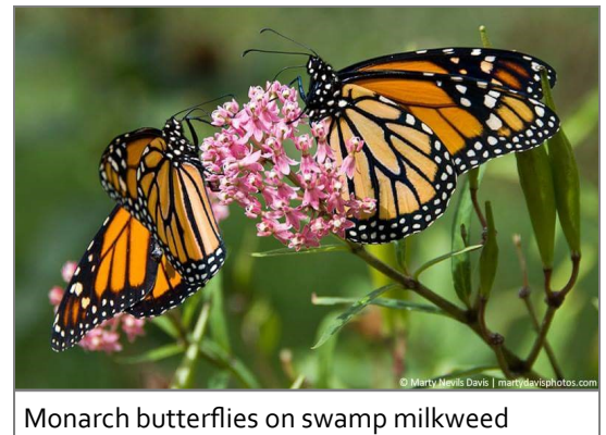
Monarch butterflies on swamp milkweed

Final Thoughts: Pollinator plantings are typically high cost and high maintenance for the first five years. If all the establishment recommendations are followed, maintenance need and expense should decrease as the native plants mature and dominate the stand. Be sure to practice the three P's and follow the steps to achieve success. Your hard work will pay off.