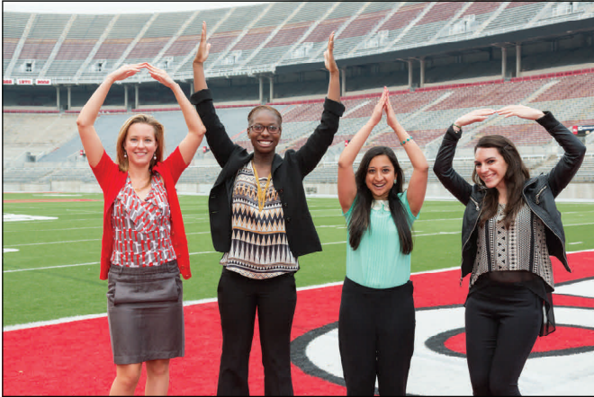
Students are invited to socials including a tour of the Ohio Stadium!