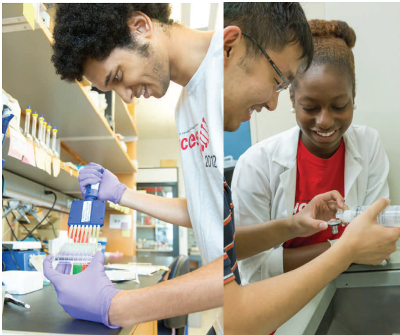
During the 10 weeks students are assigned a lab where they learn research skills