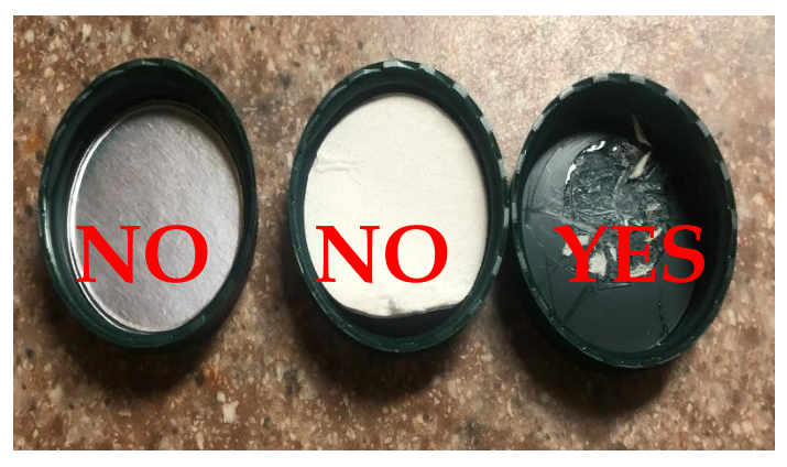
NO Foil inside cap! The foil can be removed for the cap! Thin layers of paper will not hurt our process.

The only stupid question is the question that is never asked.