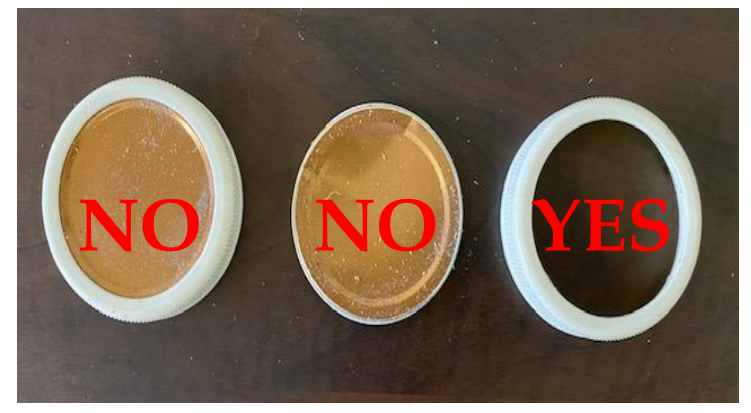
NO Plastic Ring with Metal Inside! Sneaky guy! The plastic ring can be removed from the lid! © Bonus points for recycling the metal piece with your local recycler.

e! NO large amounts of paper! The paper can be removed for the cap! Small amounts of glue will not hurt our process. Like the above and below photos.