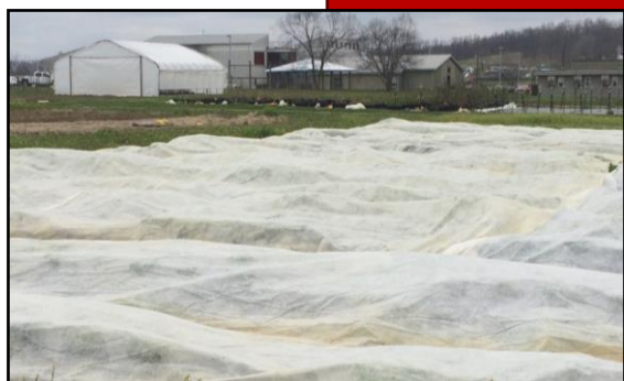
Bottom Right: Protected strawberries