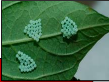
Figure 4: Healthy egg masses of BMSB; the eggs are pale green