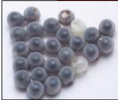
Figure 5: Parasitized egg mass of the BMSB; the eggs are black