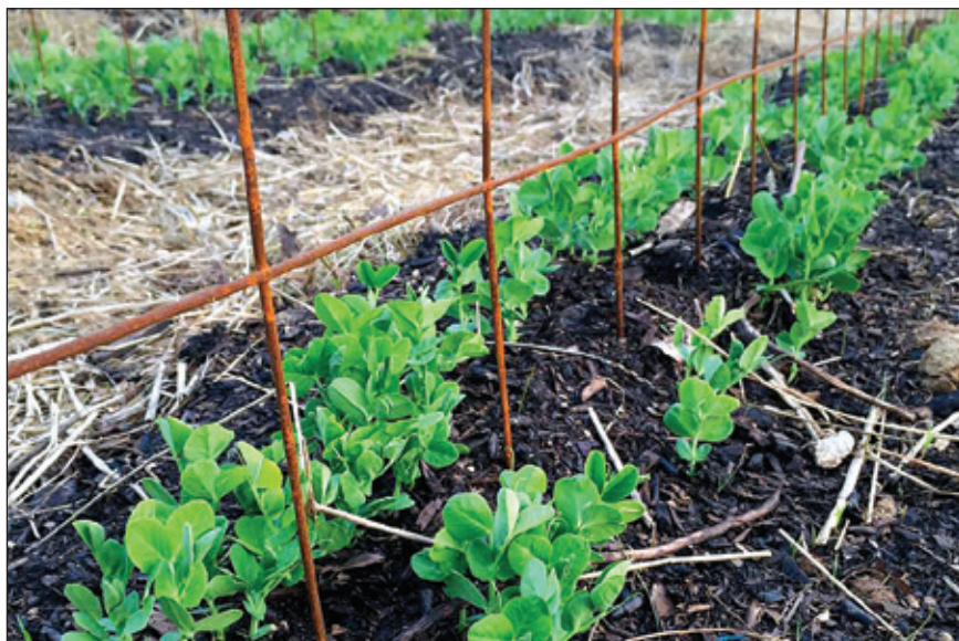
JEDIDIAH FARM AND STUDIO

Directions: From I-270 N, take Sunbury Rd. Turn east on Smothers Rd. The farm is on the left nearly 2 miles east of the bridge. Park on the east side of the driveway, leaving space to turn around by the house.