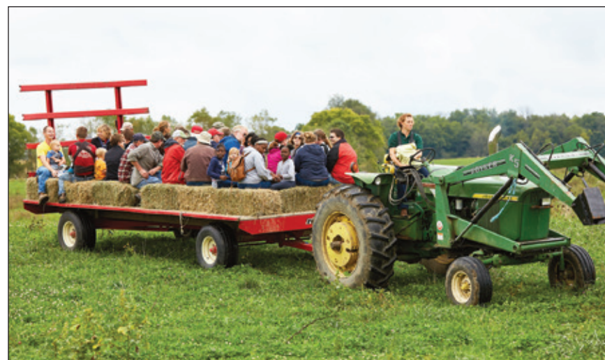
SWEET GRASS DAIRY

Directions: From Wooster, take Rte. 250 S to Apple Creek. In Apple Creek, turn left on Apple Creek Rd. and travel 1.8 miles. The farm is on the left.