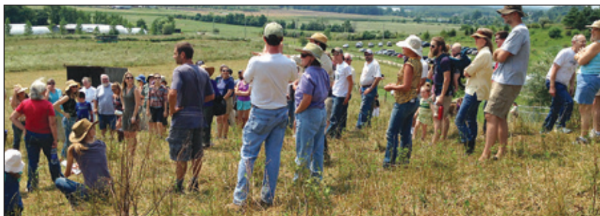
FOX HOLLOW FARM

Directions: From Wooster, take Rte. 30 W. Approximately 1 mile west of the Rte. 250 interchange, turn right on Jefferson Rd. Travel 800 feet to the stop sign and turn left on W. Old Lincoln Way. Drive 1.8 miles. The farm is on the right.