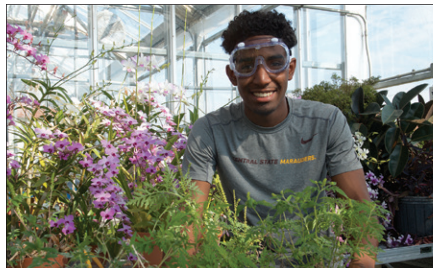
CENTRAL STATE UNIVERSITY AGRICULTURAL SCIENCES

Directions: From I-71, take Exit 111 for 17th Ave. Drive east 0.25 miles. Turn north on Cleveland Ave. and drive approximately 1.5 miles. Turn west on Arlington Ave. New Harvest is the first building on the left.