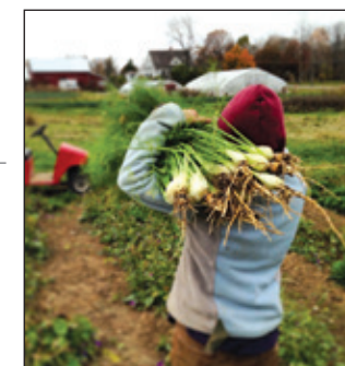
MILE CREEK FARM

Directions: From Dayton, follow Rte. 35 W from downtown Dayton towards Eaton. At W. 3rd St., turn left (west) to stay on Rte. 35 towards Eaton. Turn left on Diamond Mill Rd., and drive south for approximately 4 miles. Turn right on Mile Rd. and drive west. Mile Creek Farm is on the left in about 0.75 miles.