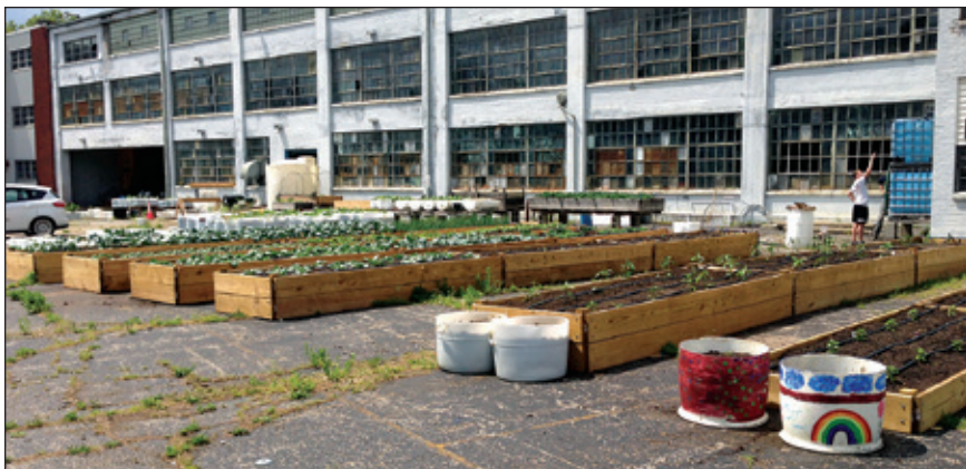
URBAN RENEWAL FARM