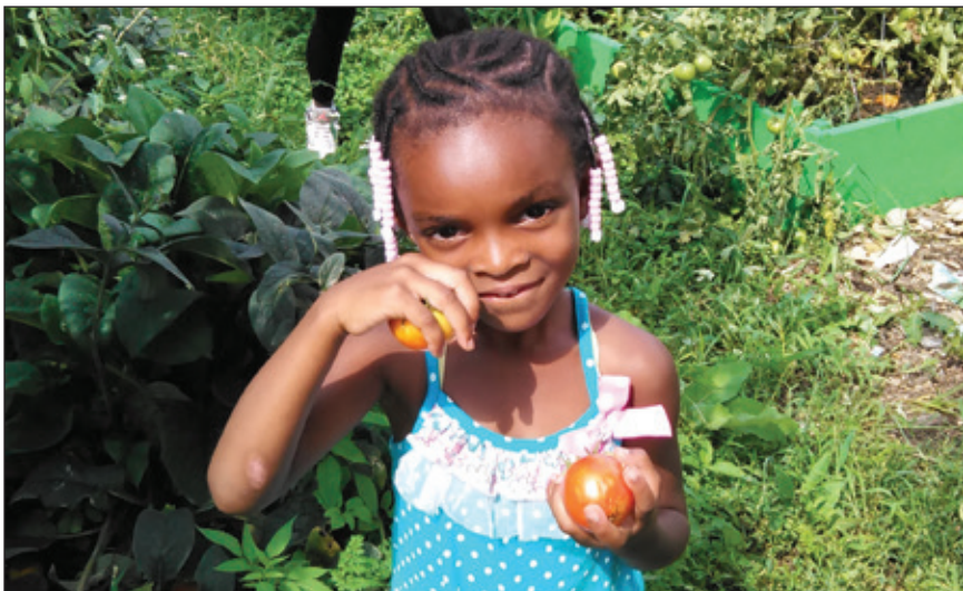
GLASS CITY CONTAGIUS

Lodging: While we strongly encourage all attendees to spend Friday night at the Procter Center to build professional networks and share farming knowledge, we understand that an overnight stay may not be possible for everyone. If you want to participate, but cannot spend the night, please contact OEFFA about special arrangements. To learn more about the Procter Center, go to www.proctercenter.org .