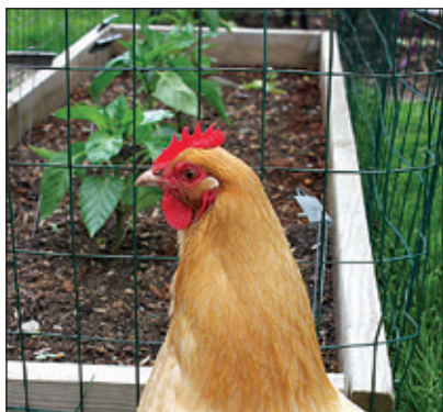
RACHEL TAYSE BAULLEUL