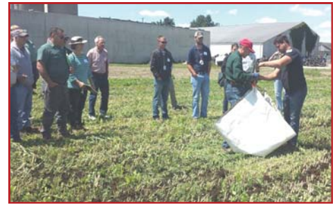
Calibration demo (MSR 2014)

Mississinawa Valley High School 10480 Staudt Road, Union City, Ohio