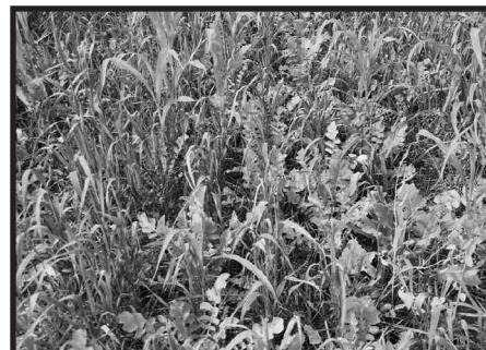
A good mix that overwinters ahead of corn includes: Oats, radish, rapeseed, balansa clover and crimson clover.