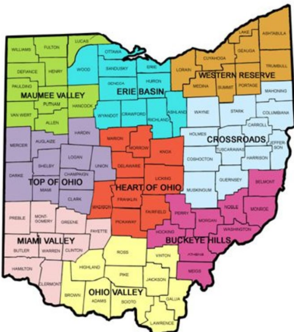
Table of Contents by Region

To find out about upcoming meetings, and get information about the Farm Bill, visit go.osu.edu/farmbill2019