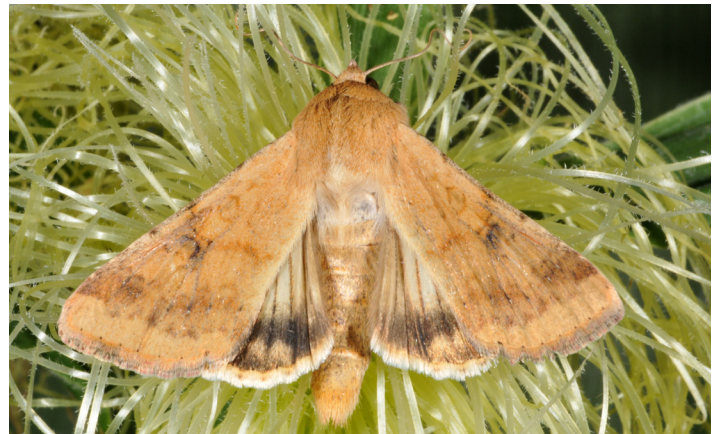
Corn earworm adult