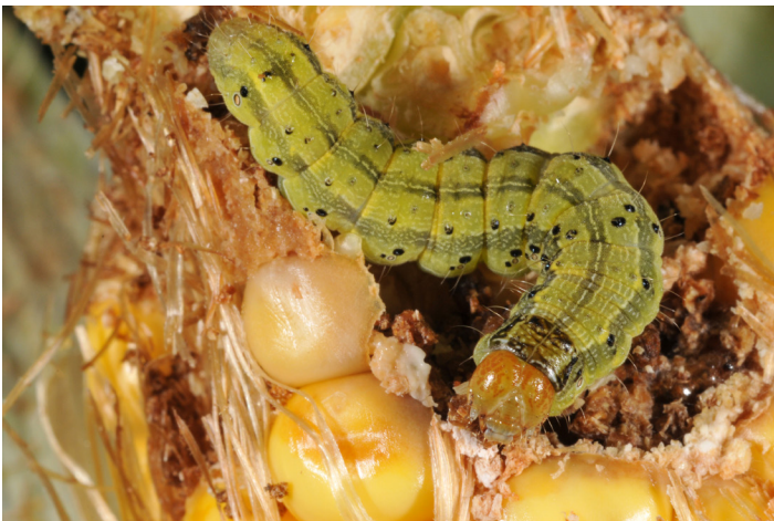
Corn earworm larva

temperature. Shortly after hatching, the young larvae follow the silk channel to the tip of the developing ear, where they feed, consuming kernels and fouling the ear with excrement. Once the larva has entered the ear, there is no effective control. Therefore, chemical control of CEW requires very good protective coverage of the ear zone so that when the eggs hatch, the young larvae will immediately contact a lethal dose of insecticide.