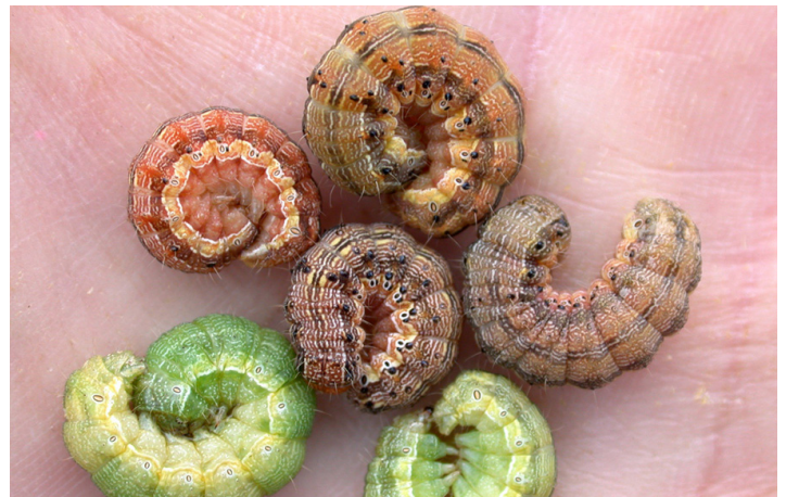
Earworm larvae come in many different colors

The CEW moth, with a wing expanse of about 1-1/2 inches, is buff colored with irregular spots and markings on the wings. The front wings have a dark "comma" shaped spot that is more prominent on the males. The yellowish eggs are small, about half the size of a pin head, and are laid individually. Fresh corn silk is the preferred egg-laying site for the moths. The eggs hatch in 2-5 days, depending on