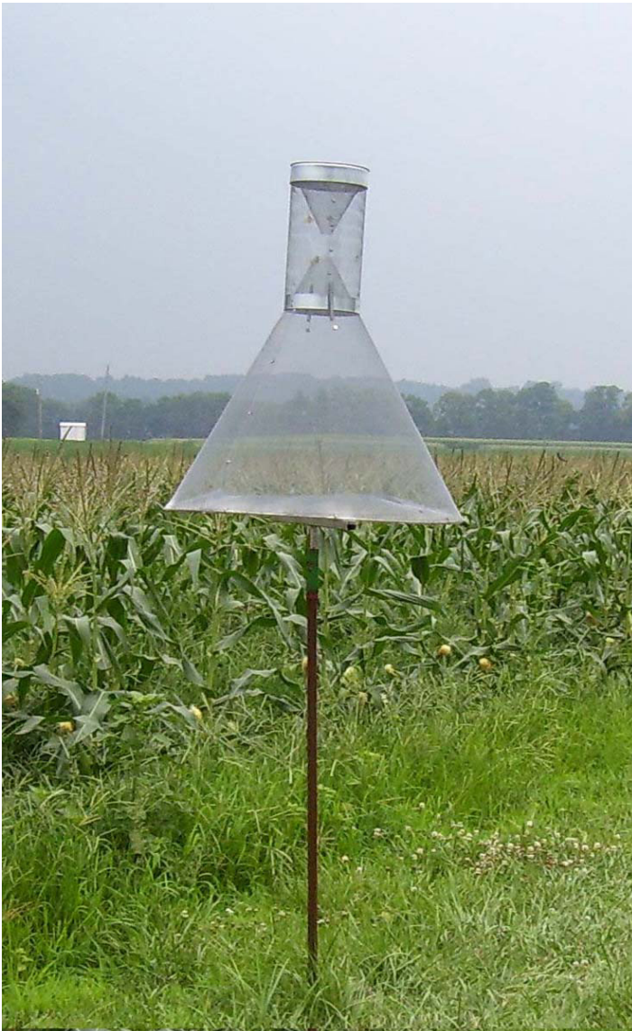
Pheromone trap to monitor corn earworm moths