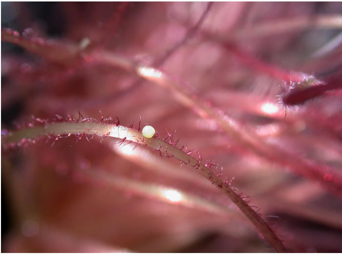
Corn earworm egg on silk