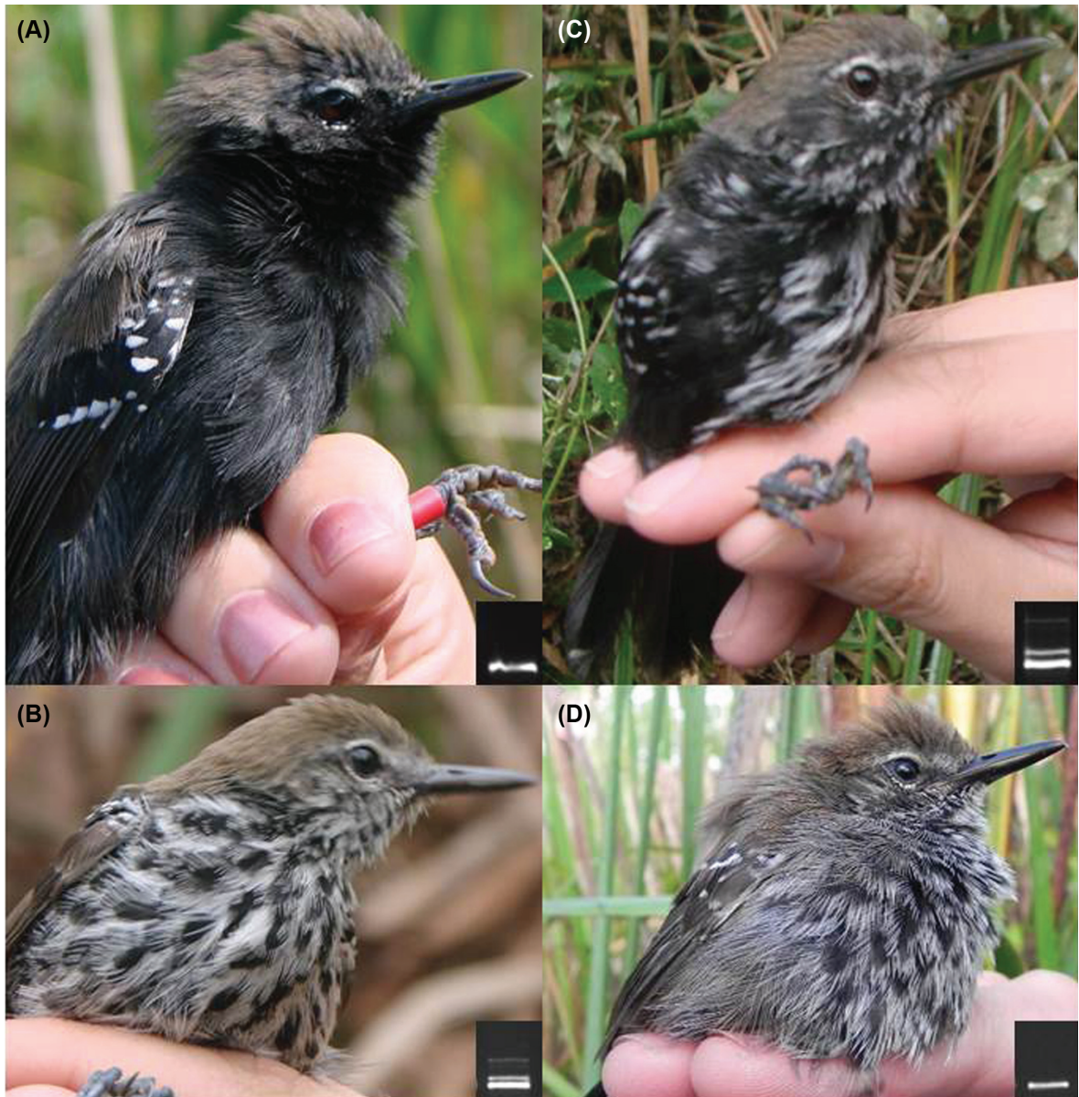
Figure 1. Plumage patterns of São Paulo marsh antwrens: (A) diploid adult male, (B) diploid adult female, (C) ZZW triploid, and (D) diploid juvenile male. In the bottom right of each picture, the band patterns of molecular sexing are depicted. The lower band represents the CHD1-Z, and the two upper bands represent the different CHD1-W amplicons generated by the combination of three primers in the same PCR reaction. Images (B) and (C) evidence that the triploid bird had a band pattern similar to that of a regular female due to the presence of both Z and W chromosomes.

The triploid individual showed an intermediate sexual plumage pattern. It could not be confused with a juvenile because its throat and the background color of its underparts were pure white, resembling an adult female, instead of the grayish background color present in the juveniles (Fig. 1). However, the black stripes were deeper than those found in regular females, and black areas, typical of males, were present in the flanks and in the neck. It did not show any evidence of color pattern lateralization (Fig. 1) typical of many gynandromorph birds (Agate et al. 2003). Marsh antwrens exhibit adult plumage at the age of about seven months