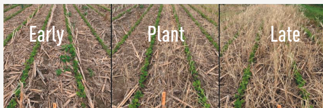
Figure 2. Effect of termination timing on cereal rye biomass in soybeans. Kolby Grint, University of Wisconsin-Madison. 5