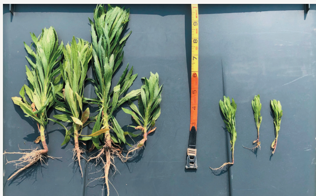
Figure 1. Horseweed collected from plots with no cereal rye (left) and with cereal rye. 2

the fall so the outcomes are known before seeding cover crops in questionable fields later in the fall.