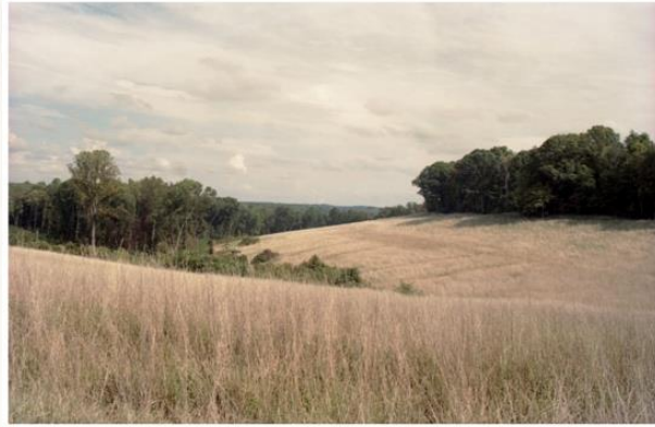
Postcard from the Farewell Transmission Exhibit. Ohio State University Hybrid Arts Lab. Aug. 21st to Sept. 15th 2022