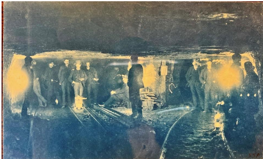
Flash Light in Ohio Mine. Circa 1890.

4:30pm Return to Nationwide and Ohio Farm Bureau 4H Center.