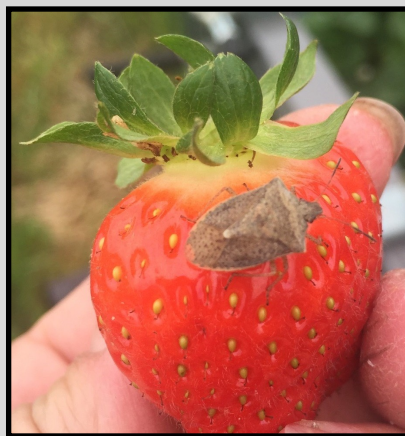
Photos: Plasticulture strawberry harvest is in full swing with light stink bug pressure being found.