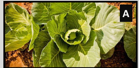
A. Cabbage from the trial

Mares says growers who have experienced the benefits of Verimark® are eager to incorporate it into their crop protection programs again. “Verimark® is an excellent option that will help growers protect their investments while meeting other needs such as worker protection and environmental stewardship.”