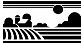
Transitioning Your Family Farm