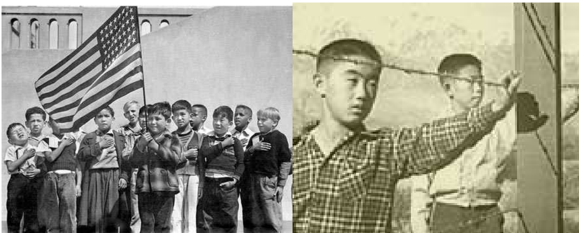
Pledge of Allegiance (Dorthea Lange).....At the end of camp(Ansel Adams)