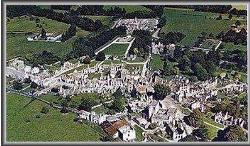
Aerial view of Oradour-sur-Glane