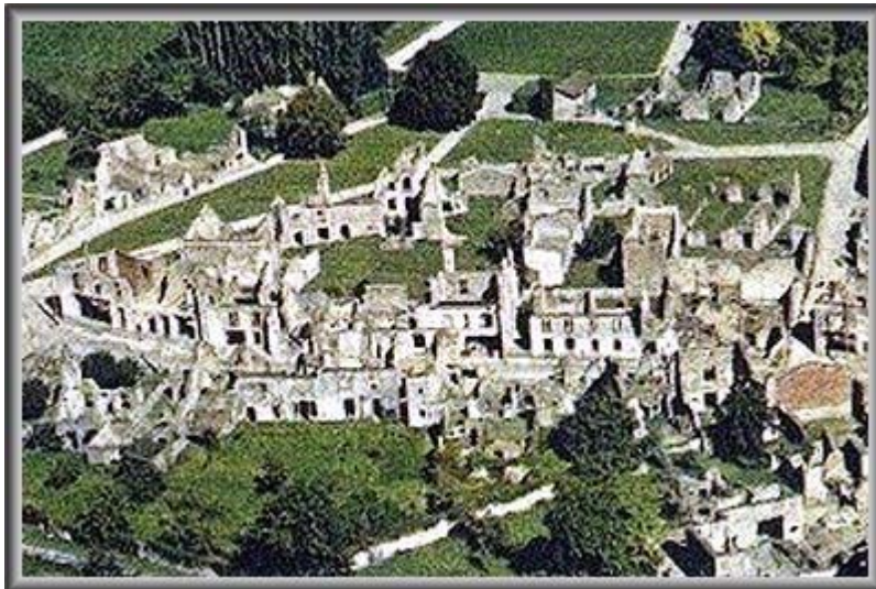
Oradour-sur-Glane's complete destruction is clearly visible, even from this distance