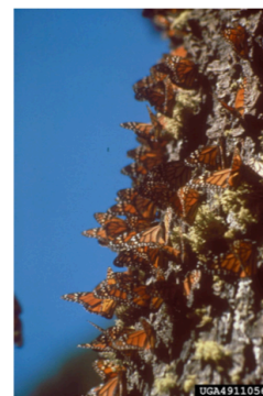
Monarch adults clustering on tree.