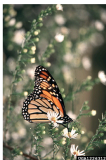
Aster