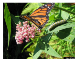
Monarch adult butterfly and caterpillar on milkweed.

The monarch butterfly migration is one of nature's most amazing feats. Millions of adult butterflies, each less than the weight of a postage stamp, make a 3,000-mile journey southward from their summering regions in the eastern United States to wintering habitat in Mexico. The overwintering adults return to the southern United States in March to mate and lay eggs for the first generation of adult butterflies. First-generation adults continue to feed and mate as they journey northward. Second- and third-generation adults mate and feed through summer, laying eggs for the fourth generation of migrating adults.